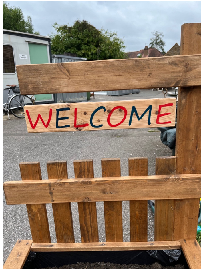
Welcome sign crafted from reused materials.