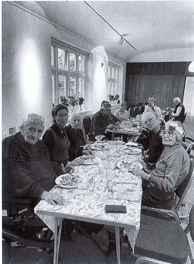
Friends of St Nicholas Church