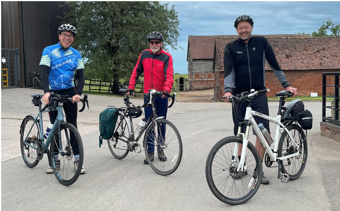
Picture from bike ride that took place 29th June 2022