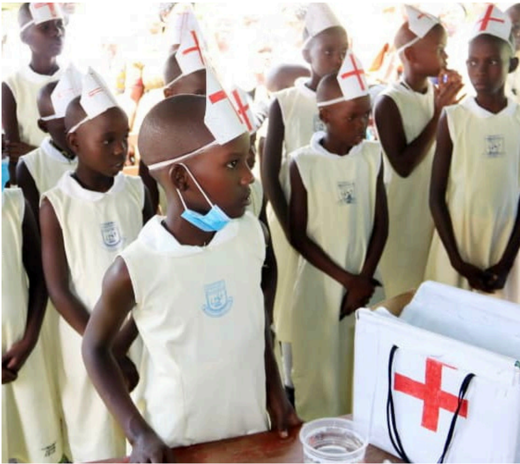
St Michael’s girls explaining to their parents the importance of having a First Aid Kit at home.

We meet our objective funding all projects to which we were already committed and provided funding for new projects - sometimes in a phased approach as donations and grants were received - eg Phase 1 foundations - Phase 2 walls and roof - Phase 3 plastering and painting.