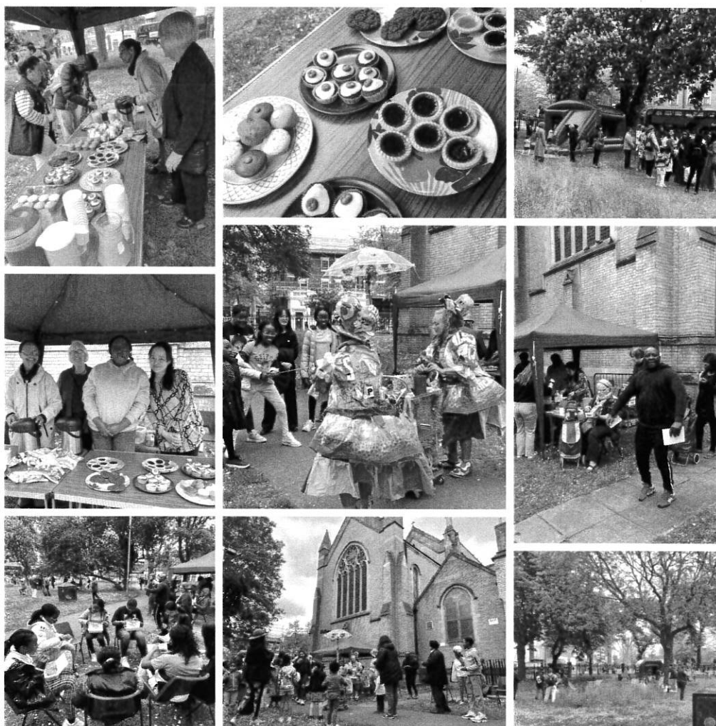
(Community Event in May 2023)

Incorporating the ANNUAL REPORT OF THE PCC AND AUDITED ACCOUNTS For the Parish of St John with Christ Church Stratford (registered charity no.1132176)