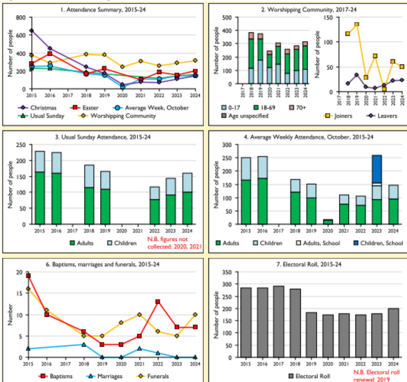
Figure 3.1: Church of England Parish Dashboard

The Dashboard below shows that 2024 saw an increase in momentum in a few measures. In 2024 we saw a growth in membership of the church with many people joining the Electoral Roll and our mailing list (an excellent indicator of commitment). We also see a turnover of families leaving London and we have noticed that the growth in members is higher than the growth in attendance which implies a pattern of less frequent attendance within our members. It is also excellent to note that our growth in under 18s is faster than our adult attendance which implies our focus on All Age worship and family outreach is going well.