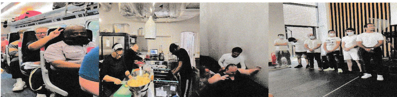
Team away day