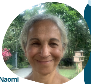
Naomi Training Bursary recipient

The Breathworks mindfulness course has been of incredible use in my work with survivors of sexual and domestic abuse and with people facing terminal illness. As the founder of a small and very grassroots non profit group, the Breathworks bursary enabled me to progress my training, so I can then offer a programme to those people we work with across North Devon.