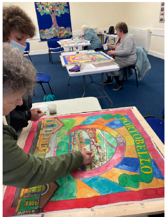
Photo is of activity at Portobello Community Centre (not St Helen's Women's Fellowship)

As time goes by, we shall hope to be able to offer a little charitable support, within the capabilities of this small group, reaching out into our local community. It seems fitting to be writing this review during the season of Lent, when our meetings ceased just after our Lenten Service in 2020, but this year with a renewed sense of hope and sunnier times ahead. Would you like to join us? You would be given a warm welcome.....just turn up and try us out!