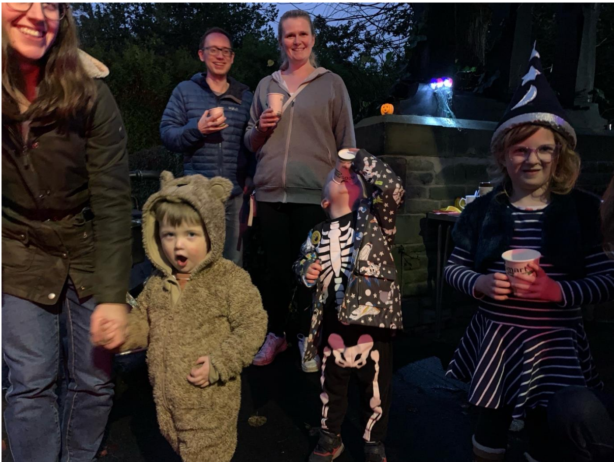
Hot Chocolates on Hill Top Avenue