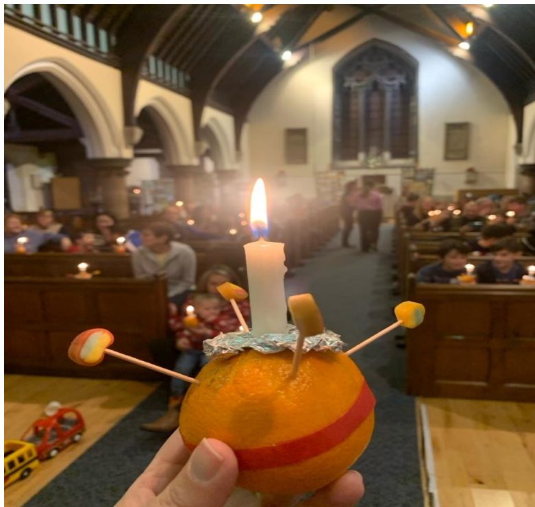
Messy Church hosted our Christingle Service 2024