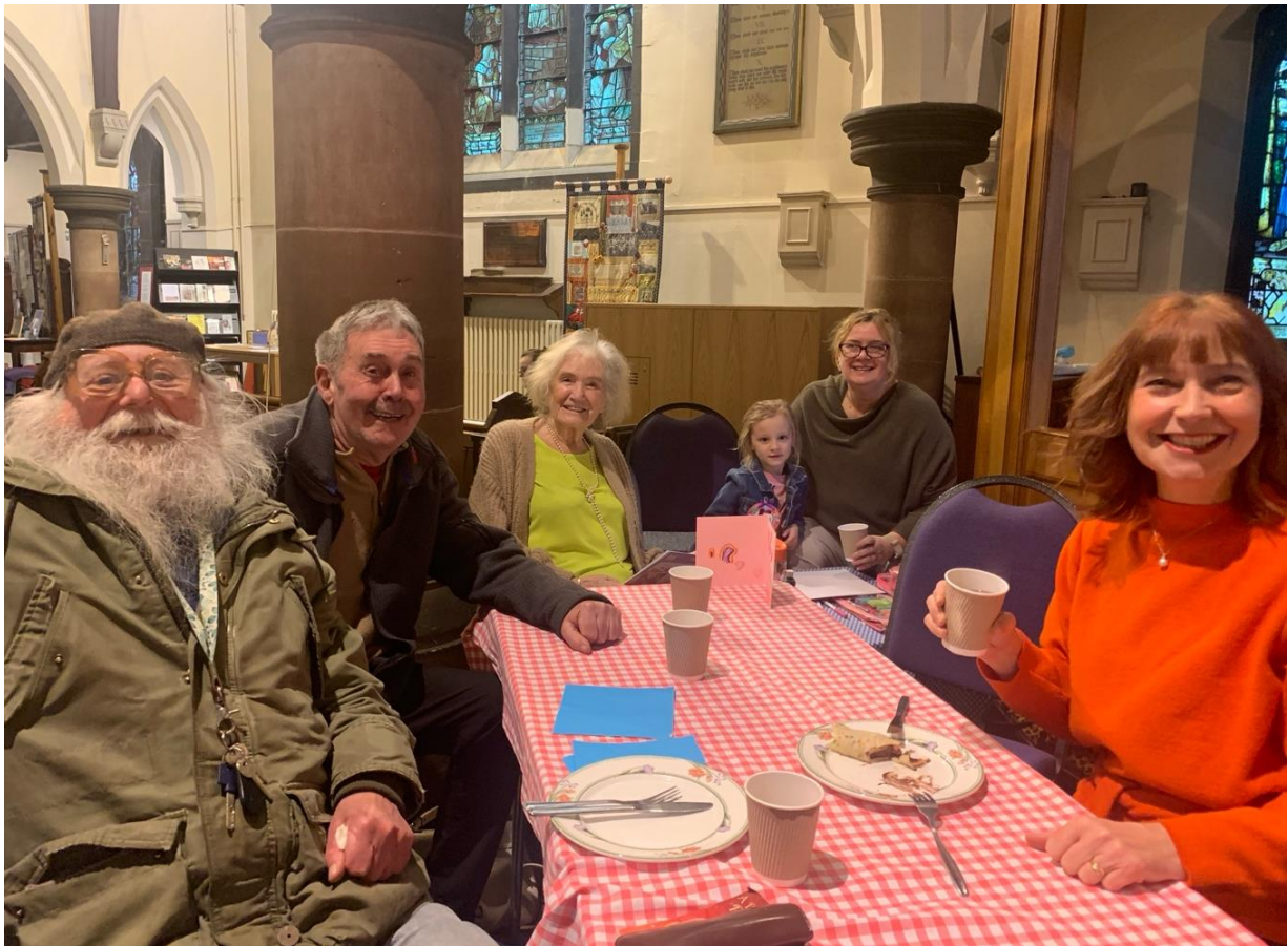
Pancake Party at church.