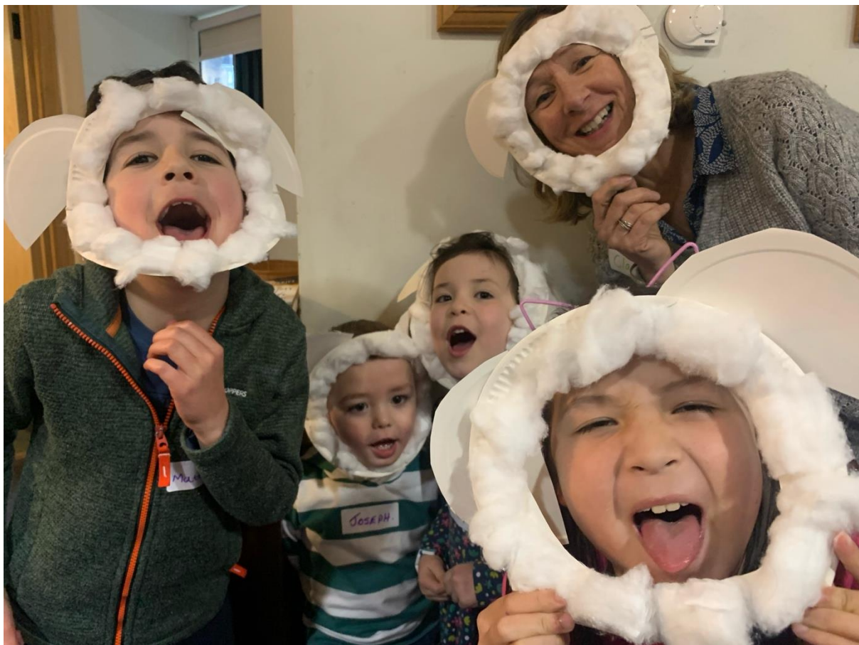
Messy Church – can you guess the theme? Sheep were involved.