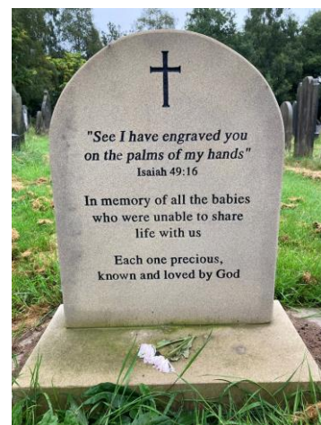
Our new memorial to baby loss arrived in Spring 2023