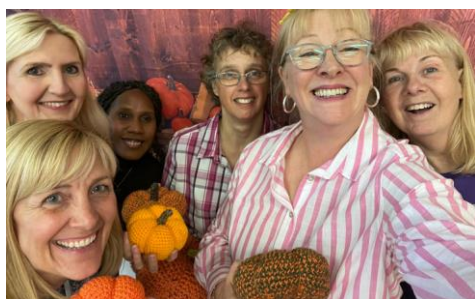
Harvest Supper, September 2023