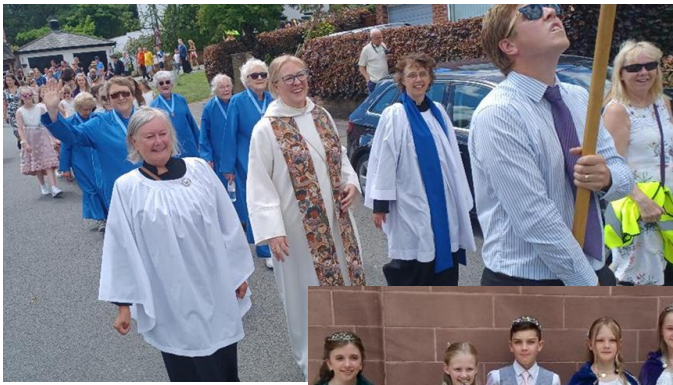
Walking Day and Summer Fair June 2023