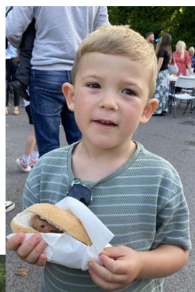
Welcome to St Wilfrid's! Reception Class New Starters BBQ