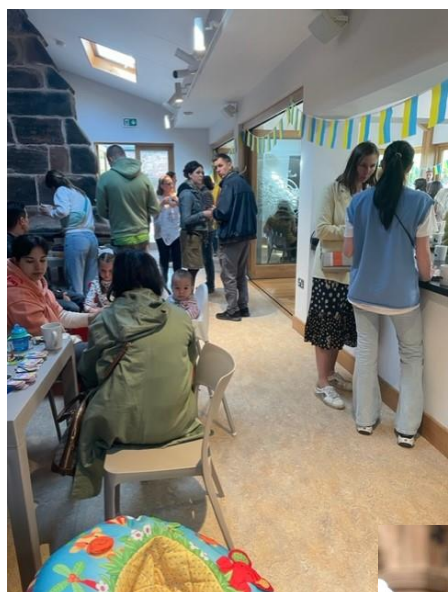
April 2022 saw us hosting a support Café for Ukrainian refugees