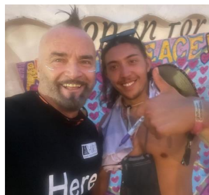
August 2022 and many more members of our congregation volunteering at Creamfields