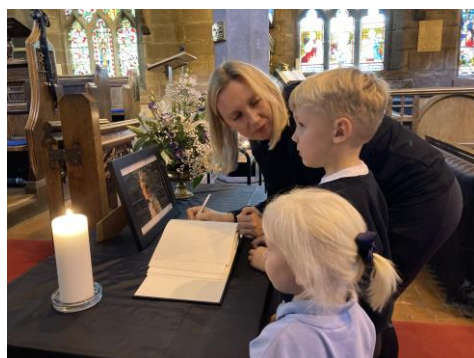
September 2022 a memorial book is opened following the death of Queen Elizabeth II