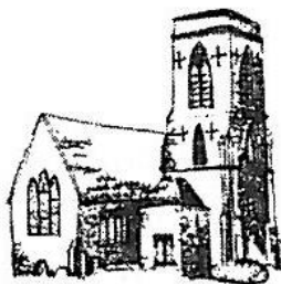
St Peter's, Langley Burrell