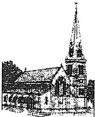
St Paul's Chippenham