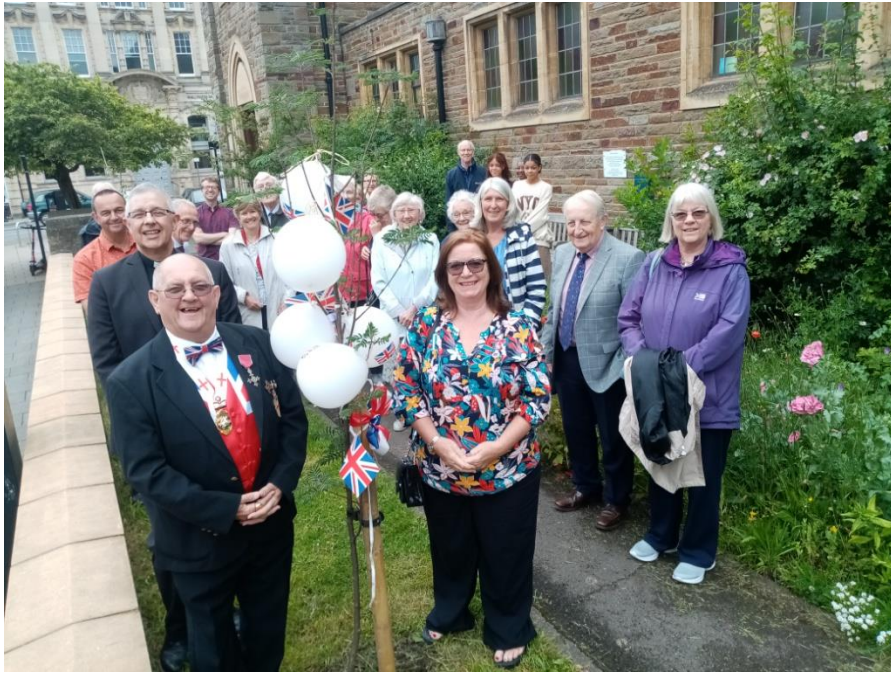
We celebrated the Jubilee of Queen Elizabeth II by planting a Rowan Tree and dedicating this on Sunday 5 June, followed by tea and cakes, and celebrated the 50 th anniversary of the URC by planting an Amelanchier Tree and dedicating this on Sunday 9 October