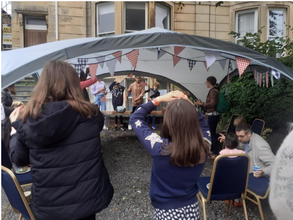
The Big Brekkie in the Church Car Park

Funds have been raised by our usual Christian Aid Fair in May, followed by a Big Brekkie the following morning before the Church service, and a Book Sale in September