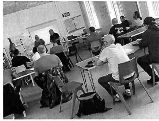
CSES Training course.