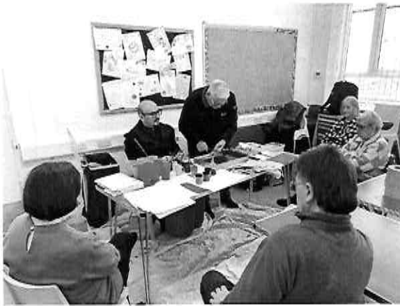
Marbling art workshop with our art group