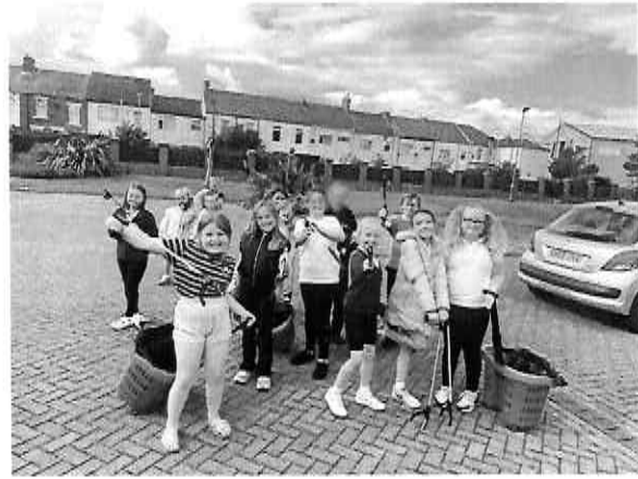
Youth club littler picking