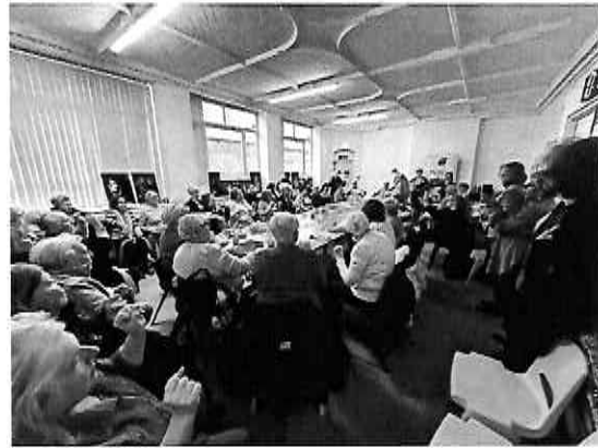
International woman's day 2024