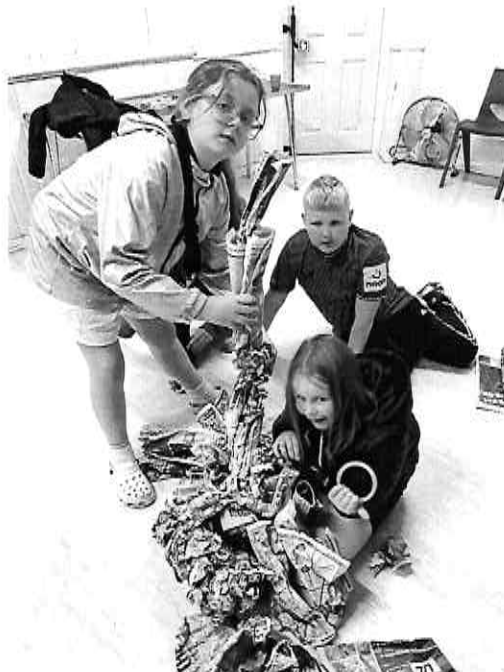
Youth clubs enjoying crafts