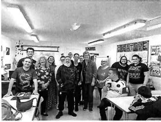
Community centre visit Northumberland Police Crime Commissionaire.