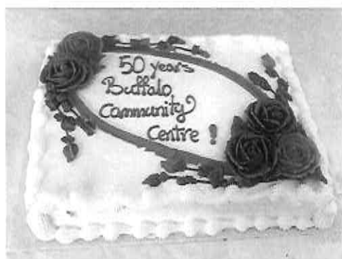
50 th Birthday Event Buffalo Community Centre