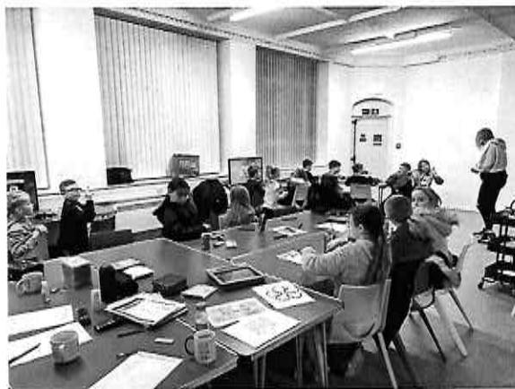
Youth club art sessions