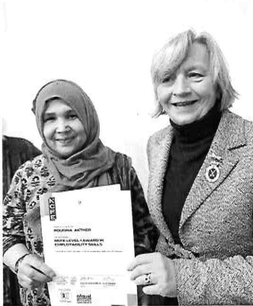
Employment courses our BAME women's group