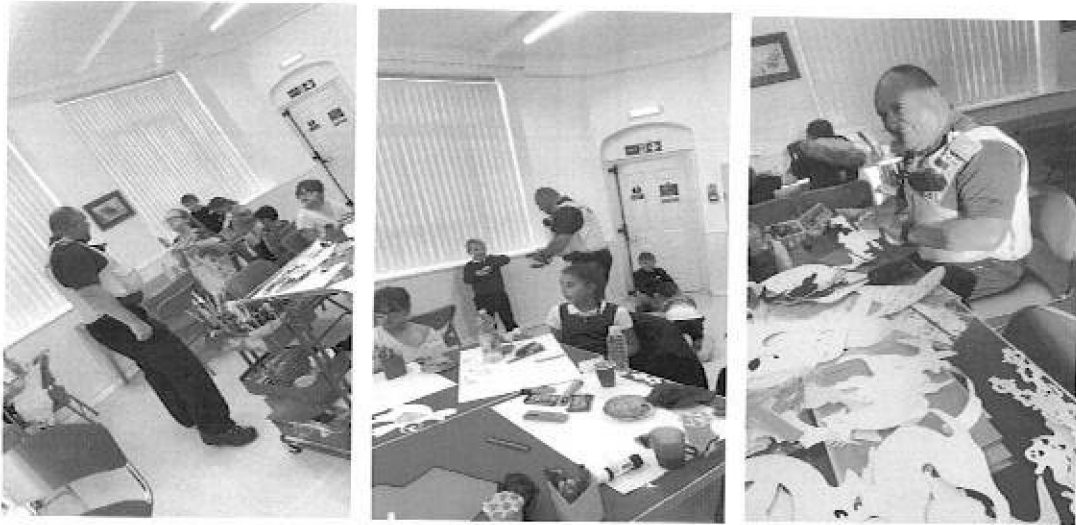
Our local community PCSO joining in with our youth club young people