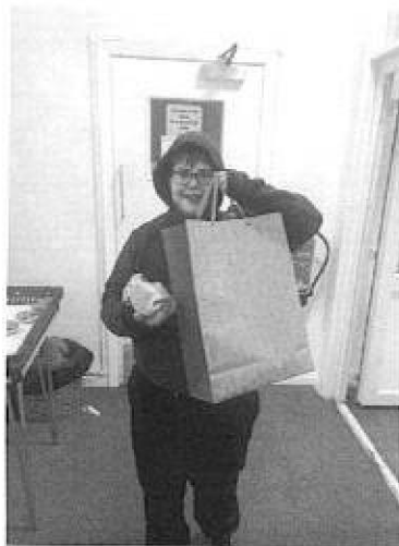
One of the many activity packs our Leaders gave out during lockdown