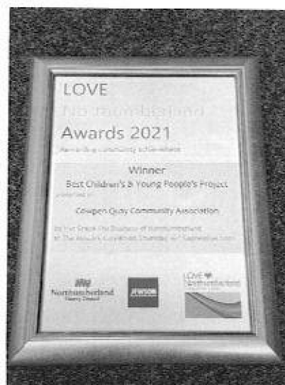
Love Northumberland Award 2021