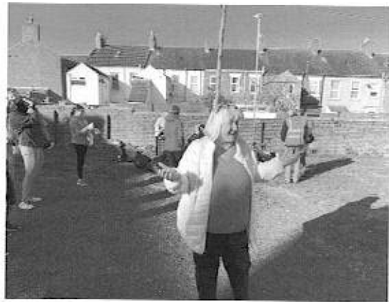
Litter picking with young people over on Crofton Fields safely at a distance during Covid-19