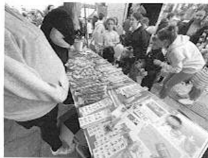
Blyth Carnival 2021