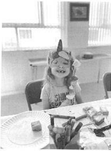
One of our younger members enjoying their healthy eating session