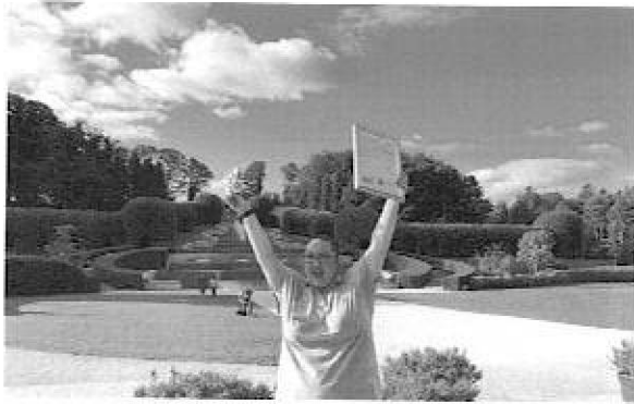
Buffalo youth projects won the I Love Northumberland Awards. Presented by the Duchess of Northumberland Alnwick Gardens September 2021

running Covid19 compliant but it's like starting up anew charity again because many people are still very frightened to come out especially the BME women, the elderly and disabled.