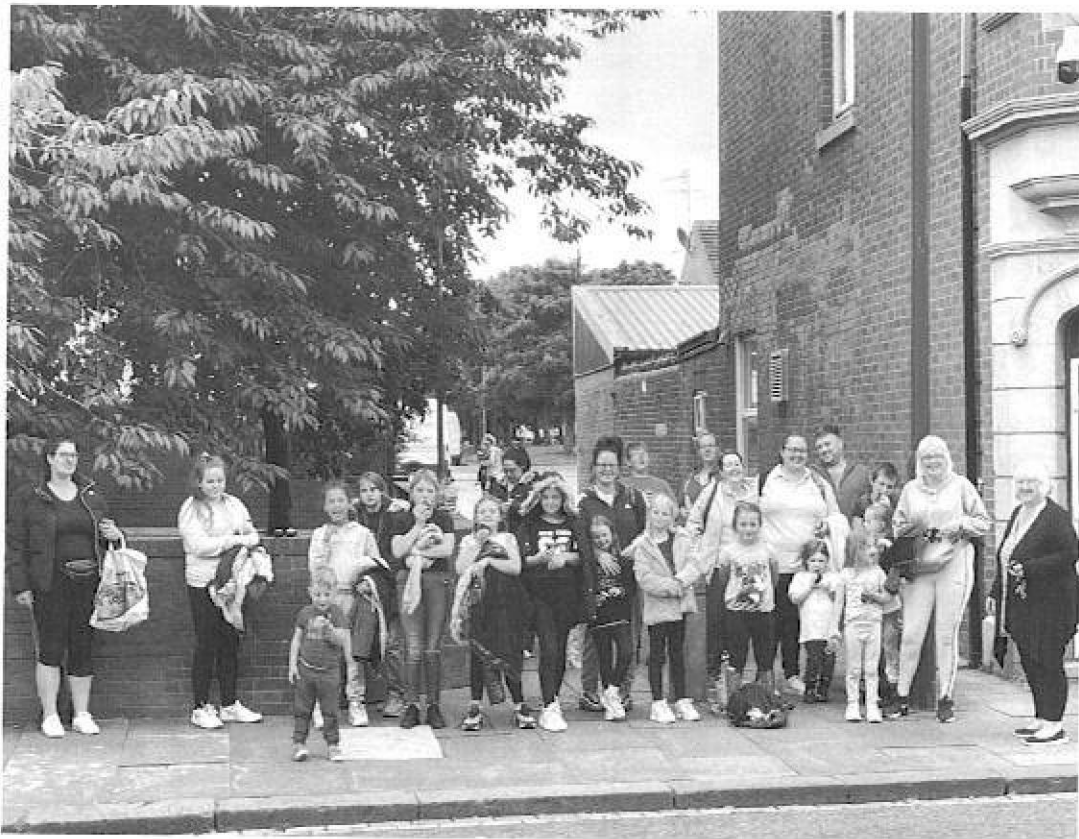
Youth club trip to White House Farm.