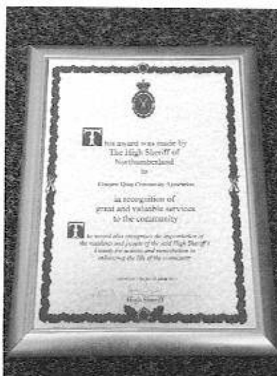
High Sheriff Award 2021