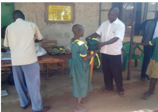
Girls receiving uniform as support to education.

Education package for girls and literacy and numeracy skills took center stage. School going children particularly girls have a challenge of uniforms. The journey of girls' careers remains short and slippery and thus keeping supporting them with education and basic needs contributes to their struggle to overcome challenges that terminate their education. In this respect, through our support, our partner provided 1150 school packages that included uniforms, bags and sanitary pads to girls. Over the years, the number of needy girls has been on the increase thus increasing pressure on the resources. However, our partner