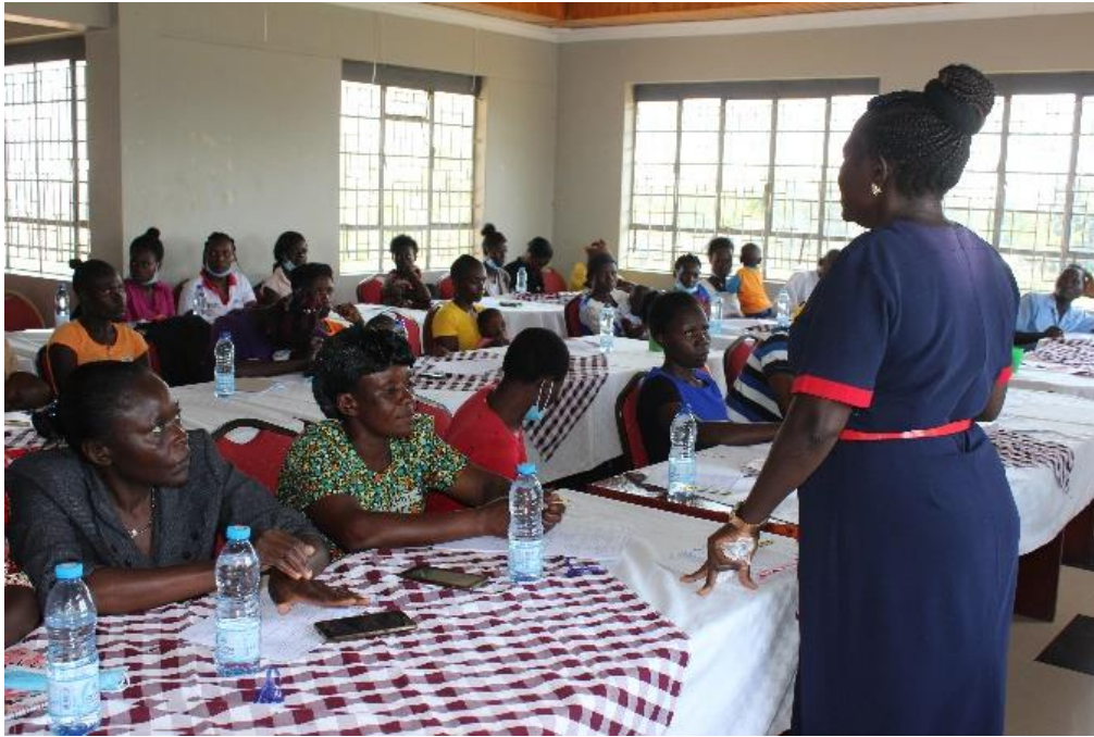
Special collaborative meeting with women professionals to discuss the plight of girls