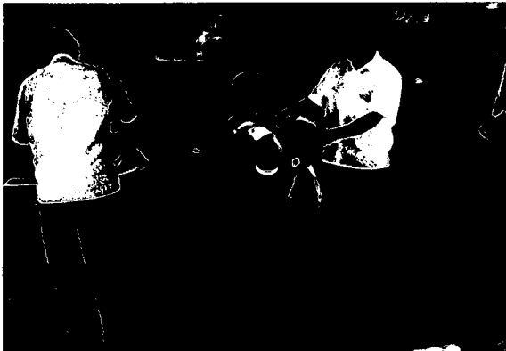
Girls receiving uniform as support to education.

Education package for girls and literacy and numeracy skills took center stage. School going children particularly girls have a challenge of uniforms. This activity started before interruption with Covid-19 and postponed until schools re-opened partially in November 2020 and fully in January 2021. 731 packages have been delivered and over 200 are waiting delivery as the targeted girls continue to report to schools. Earlier, collaboration with school management committees, stationery, uniforms, and bags were delivered to identified children's homes around schools. The demand for uniforms has been