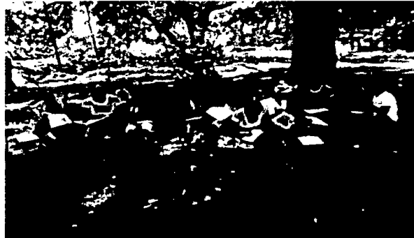
Mother training conducted onsite.

Training of mother groups attracted many participants than earlier anticipated. The training provided opportunity for mothers to meet and discuss various aspects particular Covid-19 restrictions and management. A total of 29 mother groups with a membership of 858 received the training on hygiene and more groups have requested for the same training. From the training, participants confessed to have assumed many issues relating to menstrual hygiene and many felt the training will also