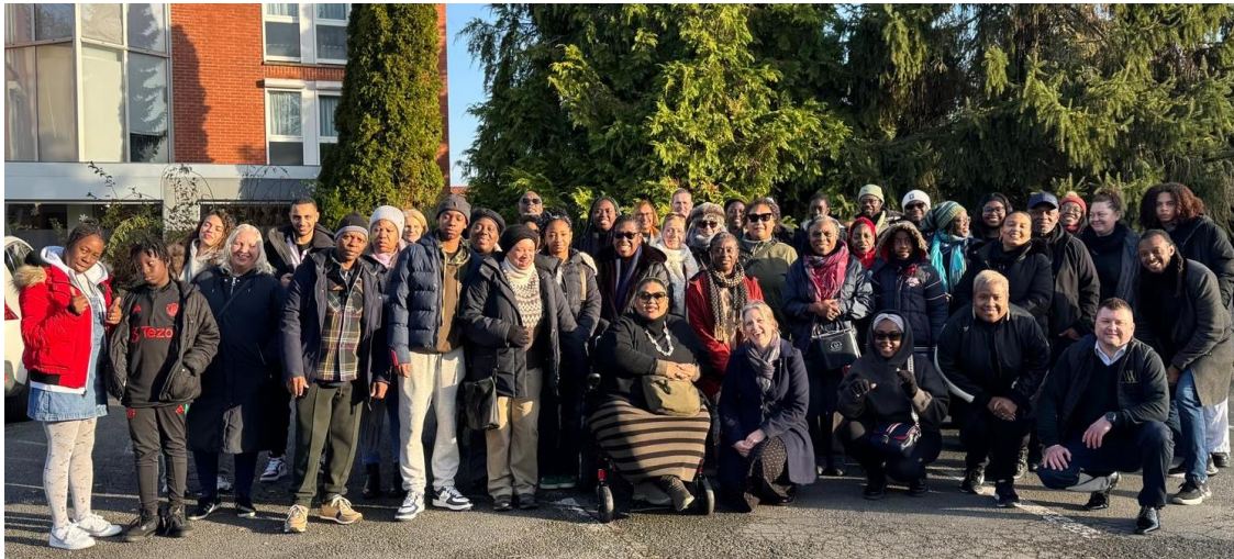
Immanuel Arras Massive!