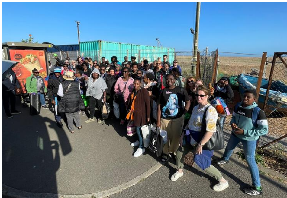
Immanuel and St Andrew Coach Trip to Folkestone!