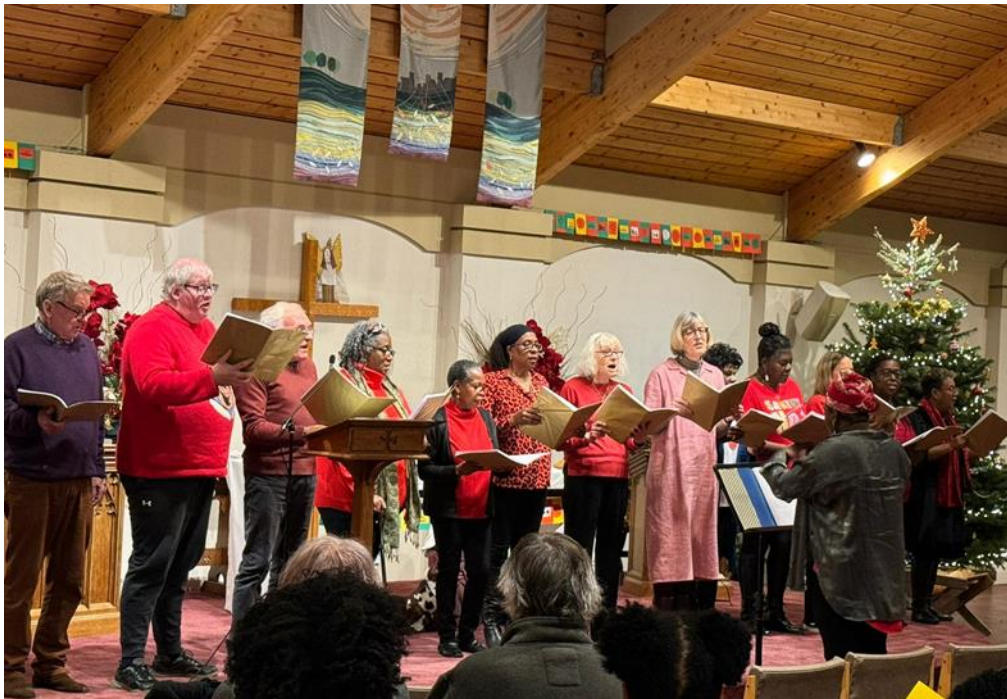
The Immanuel Christmas Choir 2023