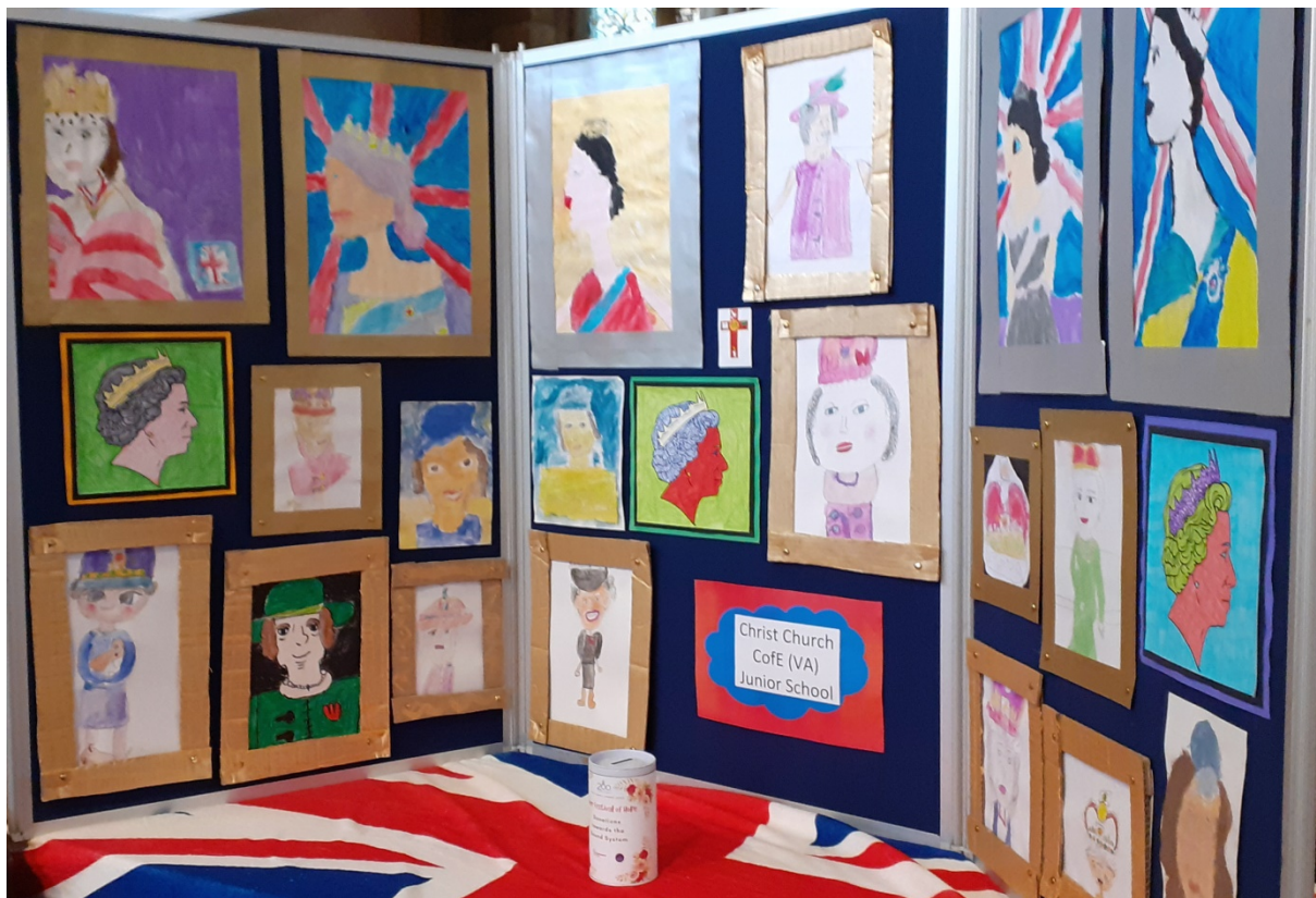
The Queen's Platinum Jubilee –Artwork from our Junior School