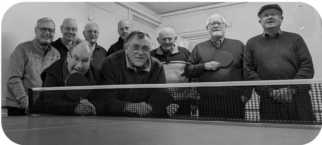
Table Tennis group members