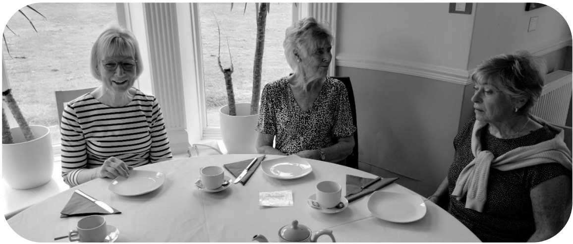
Fellowship Group members enjoying afternoon tea at the golf club