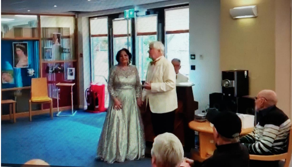
Haynes Dementia Centre, Haringey.