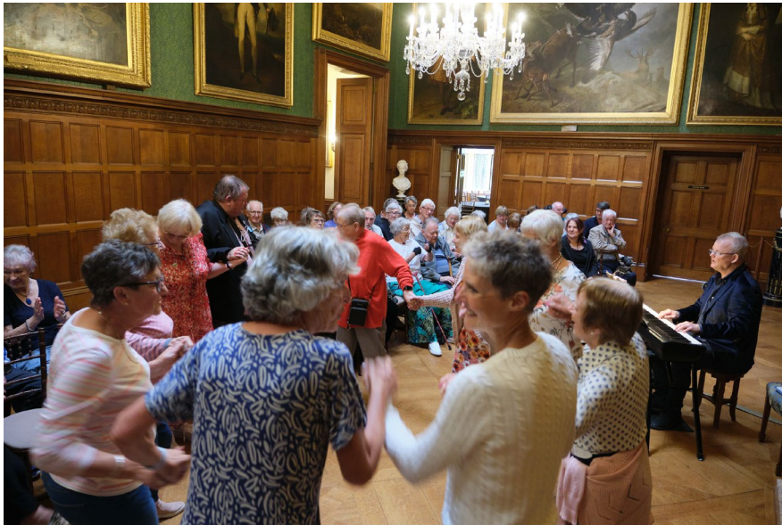
welcome and looking