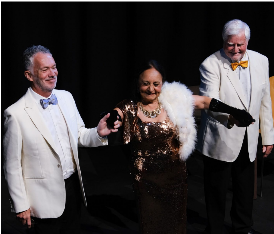
Hampton Hill Theatre.

ISLINGTON GIVING , through their grants awarded by the panel, Golden Grantmakers , enabled us to perform 8 concerts in Islington, their area of benefit, during 2024.