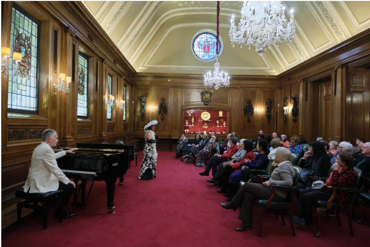
Hosted by the Mercers' Livery Company in the stunning Mercers' Hall.

City Bridge Foundation (the Gold Standard of Funders) provided our main support during 2024/202, when many of our regular sponsors were experiencing severe cutbacks due to the cost-of-living crisis. We are more than delighted that we have been awarded a third year of continuation funding from this very special and supportive funder. The Foundation have been having a massive overhaul of their funding programmes. We are extremely fortunate and grateful that we have received, in this funding year, a Cohort I grant of £9,945 which they have paid in one lump sum. We thought it wise to maximise the benefits of this grant by arranging many of the concerts in Heritage sites, thus enabling a much larger audience of elders to attend and benefit.