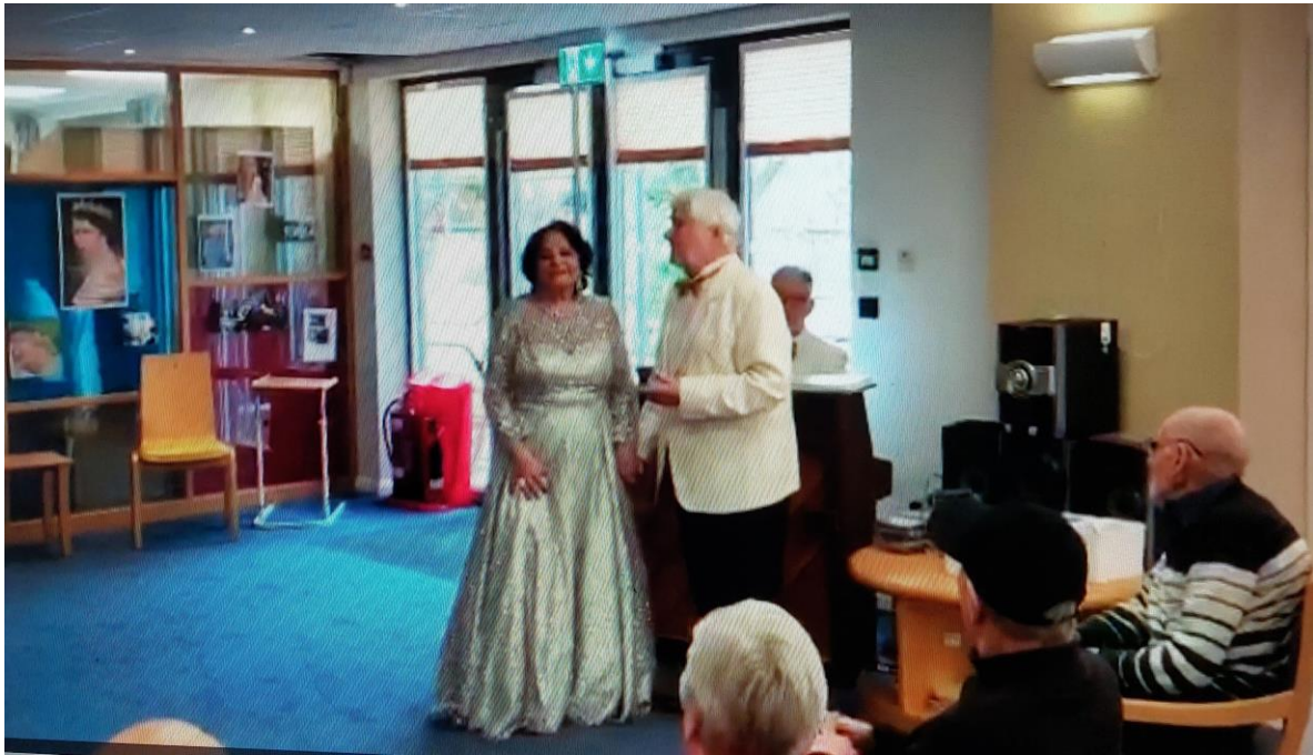
Haynes Dementia Centre, Haringey.