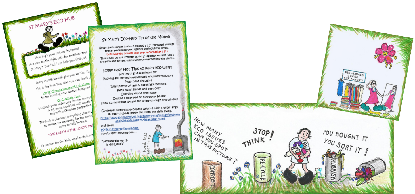
Some of the recent eco tips from the eco hub

As part of the hub's work we have audited our current energy/carbon/water use or footprint, and continue to explore ways in which we could improve our environmental performance. Discussions with Winchester City Council's conservation officer have taken place about the potential to place solar panels on the hidden part of the roof of St Mary's as part of the Cherish Project.