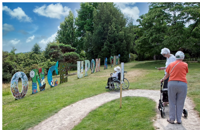
Trip to Furzey Gardens