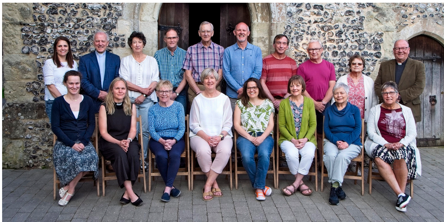
PCC of Kings Worthy

The PCC has met 9 times since the last APCM (May 2023) on the following dates: