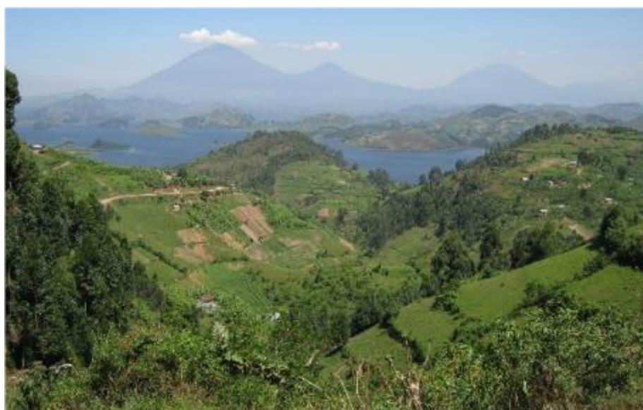
Lake Mutanda, Muhabura Diocese, Uganda