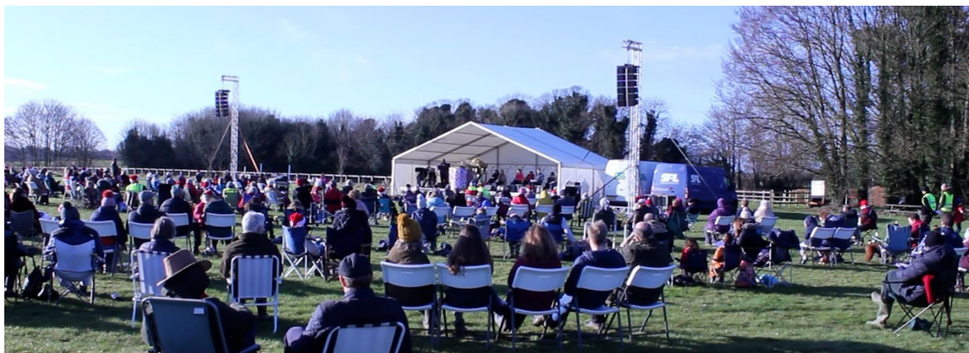
Outdoor Christmas service at West Stoke Farm