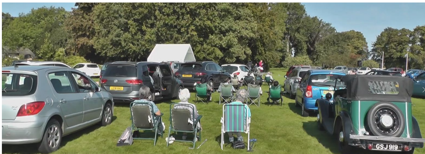
September Drive-In Service at West Stoke Farm

Our buildings may have been closed for parts of the year but we successfully held a number of events.