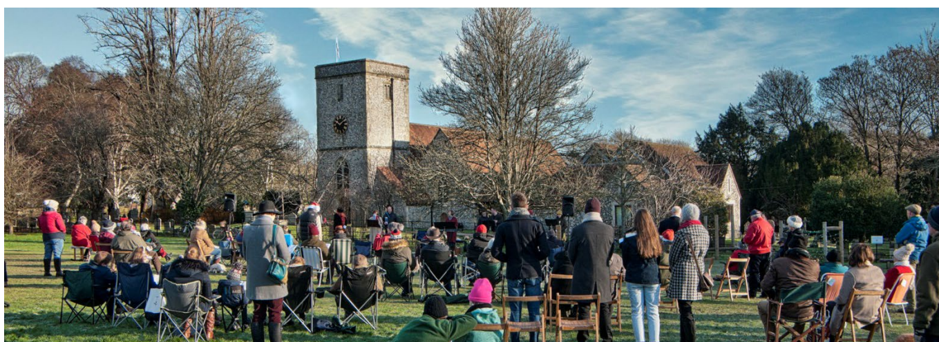
Christmas Day Service on Church Green