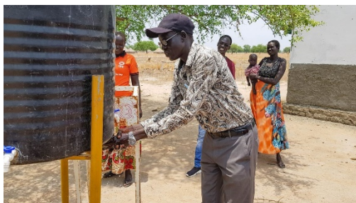
A handwashing station set up by Tearfund's local partner in South Sudan