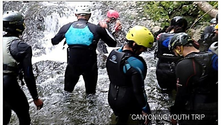
CANYONING YOUTH TRIP