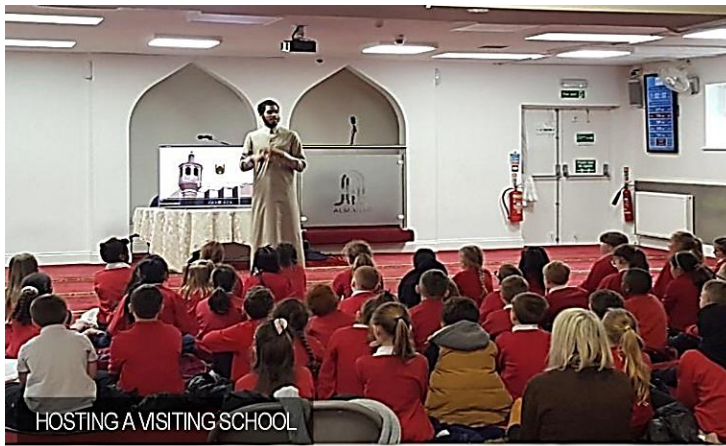
HOSTING A VISITING SCHOOL