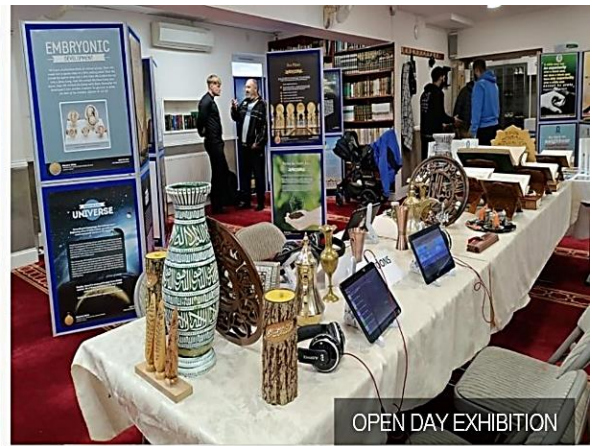
OPEN DAY EXHIBITION