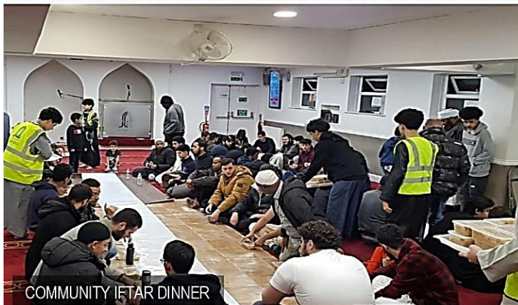
COMMUNITY IFTAR DINNER