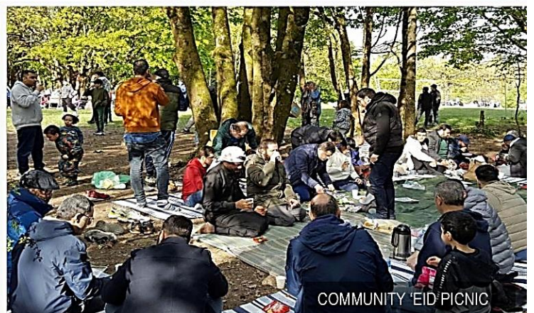
COMMUNITY 'EID PICNIC

Putting Al-Manar Centre's slogan; 'Aspiring Towards a Proactive Community' into action!