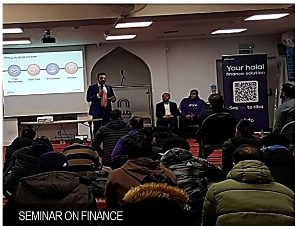
SEMINAR ON FINANCE