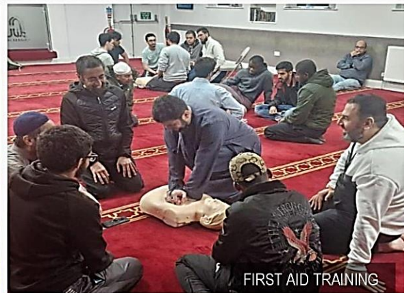
FIRST AID TRAINING