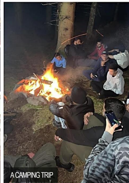
A CAMPING TRIP