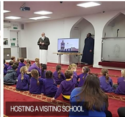
HOSTING A VISITING SCHOOL