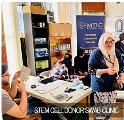
STEM CELL DONOR SWAB CLINIC