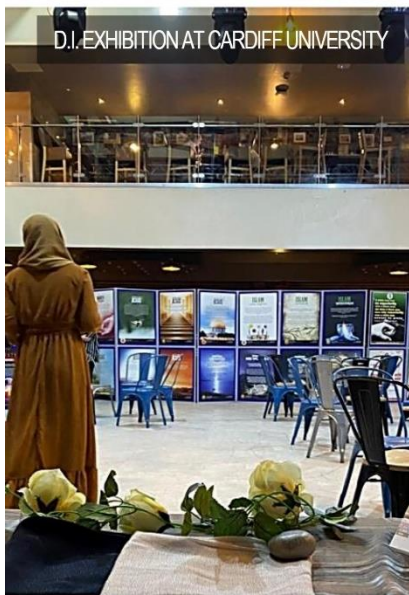
D.I. EXHIBITION AT CARDIFF UNIVERSITY