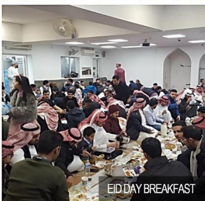
EID DAY BREAKFAST