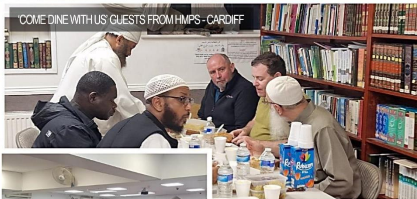
'COME DINE WITH US' GUESTS FROM HMPS - CARDIFF