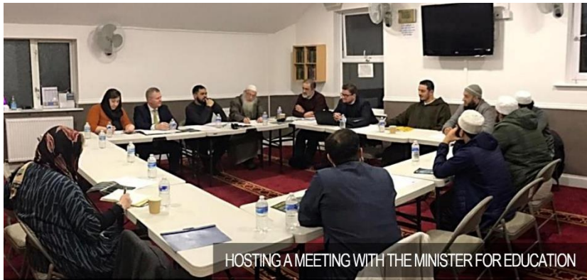
HOSTING A MEETING WITH THE MINISTER FOR EDUCATION