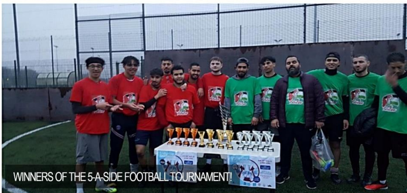
WINNERS OF THE 5-A-SIDE FOOTBALL TOURNAMENT!

Proving Al-Manar Centre's slogan; 'Aspiring Towards a Proactive Community' is a reality!