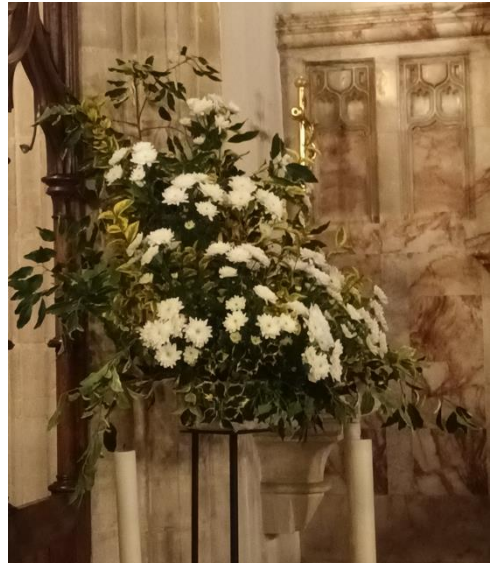
Lovely arrangements from the Flower Guild!