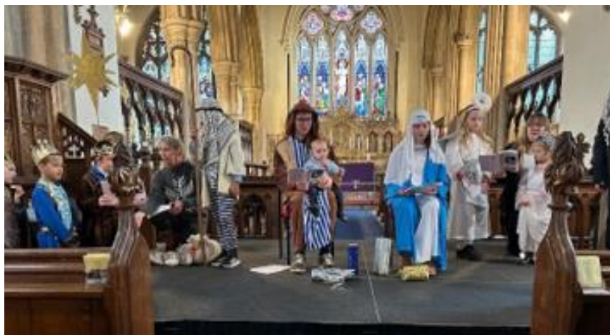
Nativity service 2023

I would like to thank the small, dedicated team of Sunday School leaders and helpers, the preparation takes some time, they are all greatly appreciated. We are always looking for leaders and helpers, so please do speak to me if this is an area where you feel you can share your skills.