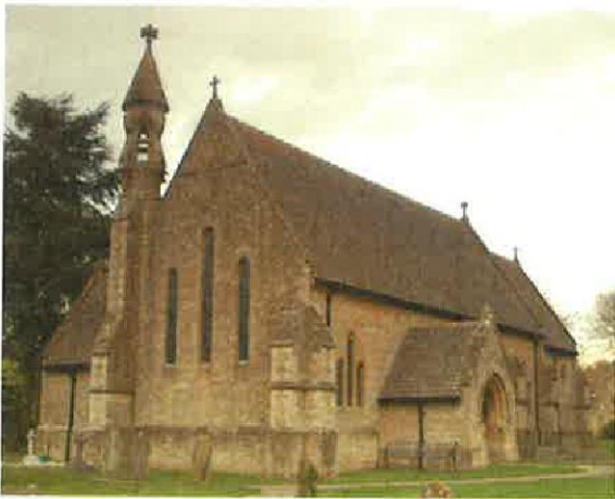
St John the Evangelist, Hailey