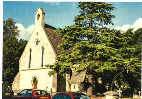
Holy Trinity, Witney