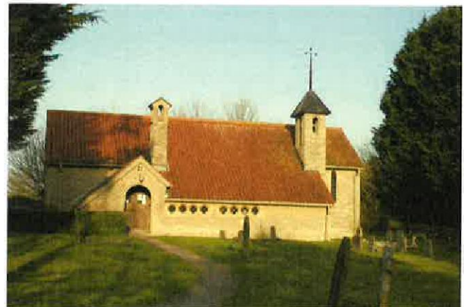
St John the Baptist, Curbridge