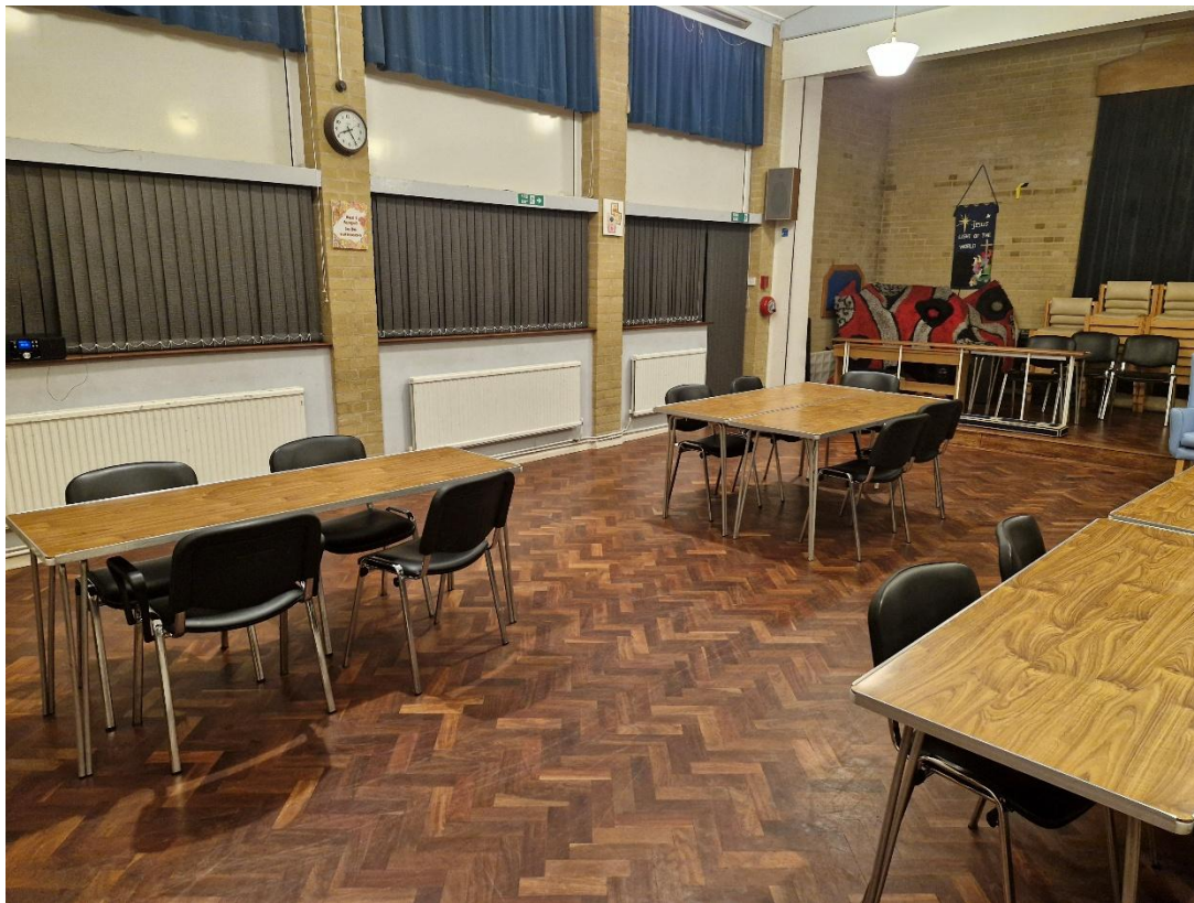
The refurbished Stoke Mandeville Church

We continue to support Stoke Mandeville and have had the floor revarnished and new blinds installed to replace the poor curtains that were present.