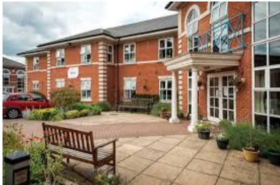
MHA Hillside Care Home

Aylesbury Methodist Church has strong ties, traditionally, with the MHA Hillside Care Home, partly as a result of our close proximity, since AMC is more accessible for residents to attend our Sunday services, if they are able. Our Minister and others regularly hold a short communion service for the residents at the home.