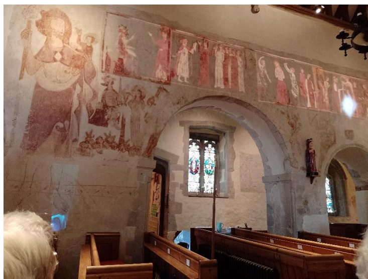
Little Missenden Church

November meeting saw us planning out next year's programme at our AGM. Because of the nearness of Christmas, we planned to meet next January for a post-Christmas lunch at the Bugle Horn. They did us proud, all fifteen of us plus two guests.