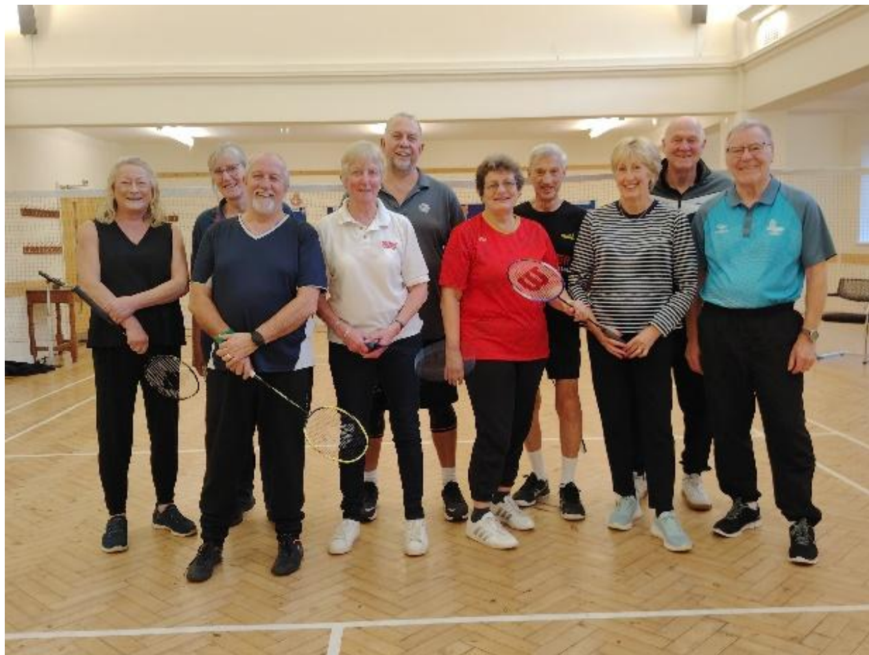
Some of the Friday Feathers members

We have now grown to eleven members, five being non-church members. Standards of play of the new members has grown as they go on. Some members have been playing for a number of years; others have only played in the back garden or haven't played for a few years so needed to clear the rust away. We do not expect players to hit the shuttlecocks every time, even I, who has been playing for nearly 60 years, miss the shuttlecock quite often.