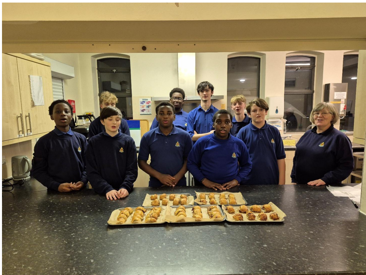
Cooking is always a popular activity; the photo here shows Company and Senior boys with their hugely successful Christmas sausage rolls