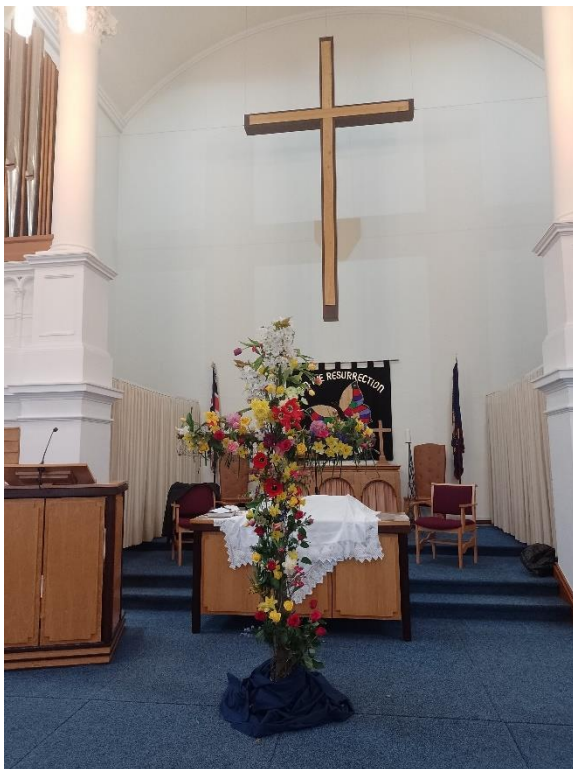
Church stewards also oversee arrangements for dressing the Easter cross

Appointed by and reporting to the church council are church stewards and our leadership team, on which the church stewards are represented. The leadership team are tasked with guiding and co-ordinating church and community centre activities in line with our mission and values. The church stewards ensure the smooth running of the weekly Sunday services and provide a communications link between the minister and congregation.