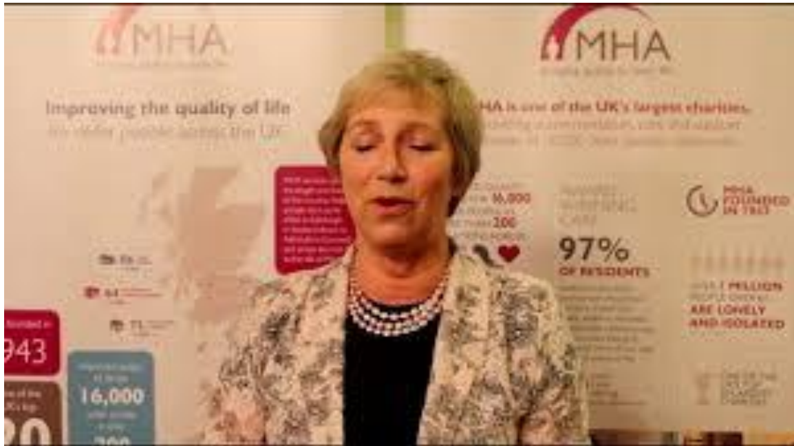
Pam Rhodes in an MHA video