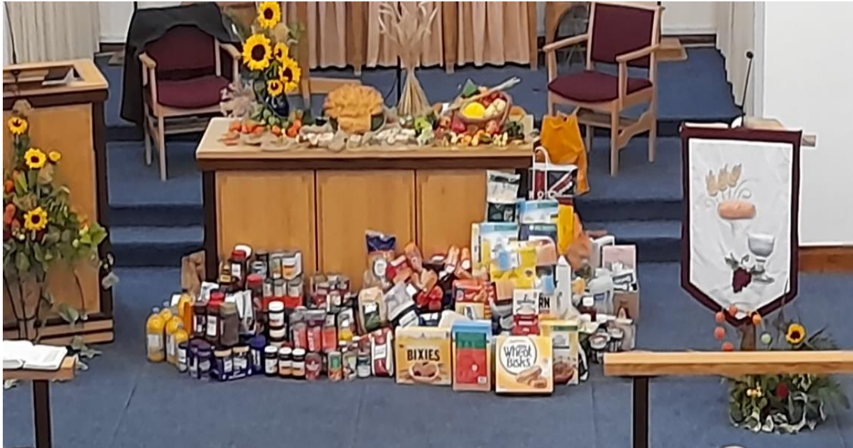
Part of the Harvest giving for Whitechapel

Tony was very pleased to see all the goods waiting for him in the entrance on the Monday morning after our Harvest, and not a little surprised!