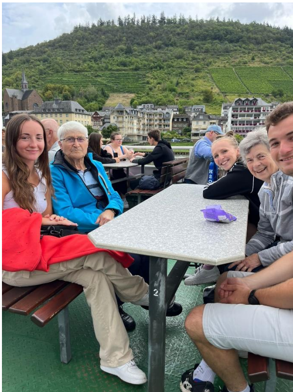
Former Exchange leaders and participants on the Moselle