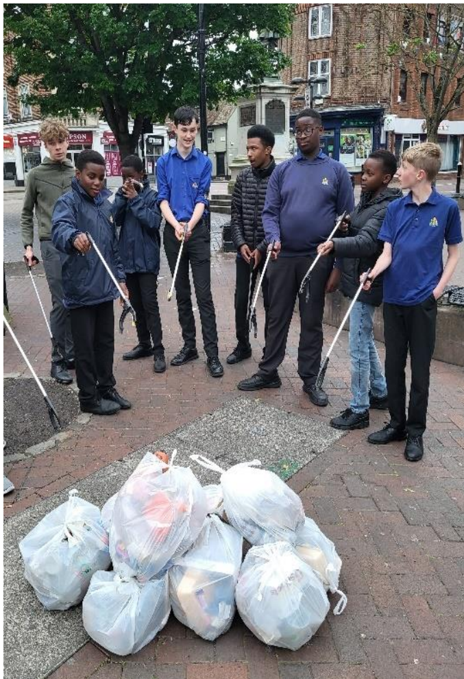
The BB's town centre litter pick

We once again shared a joint Awards/Promotion Evening with the Girls' Brigade which gave parents and carers the opportunity to celebrate the achievements of boys and girls in the Brigades.