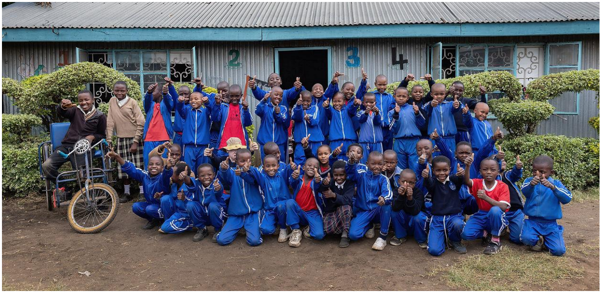
Some of the children at Njoro

the families Karibuni is involved with. This is having a serious knock-on effect on Karibuni's budget, as all the projects we are working with request extra funding to continue providing the children with nutritious food. The last thing we want to do is reduce the nutritional value to these children, who get little or no food at home. Despite the challenges the social workers and other staff continue to explore ways of raising funds in their own areas.