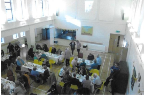
Table talk at the GB's 50th anniversary.

At Girls' Brigade we have had an exciting time over the last year. Back in October last year we celebrated the 50 th Anniversary of 1 st Aylesbury Girls' Brigade. We were joined at AMC by around 100 guests from past and present at 1 st Aylesbury. Captains and Officers from the past 50 years and people who had helped at GB or been