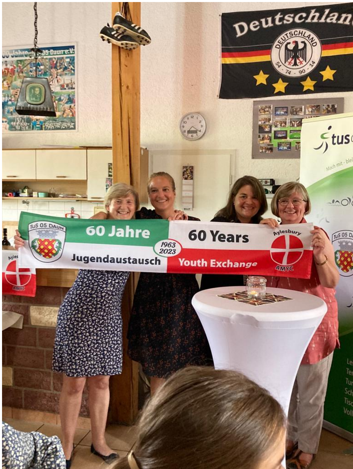
Celebrating the 60 years of our German youth exchange in the TuS 05 Daun clubhouse

in 1963 only 18 years after our two countries had been at war with one another, would still be going strong well into the following century!