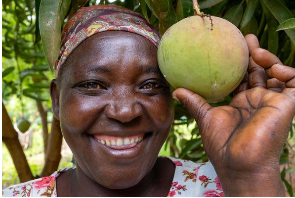
Fruitful times at Tharaka

At Tharaka , they continue to plant and provide fruit trees that were granted to the project by another organisation. The workshops built around the edges of the project are all rented out to local artisans and some of the project's own young people who have qualified as dress-makers, beauticians, or carpenters. This brings income and independence to their families.