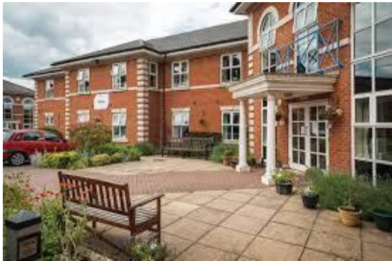
Hillside Care Home, Aylesbury

We are driven by the desire to inspire the best care and promote wellbeing for every individual as they journey through later life. “