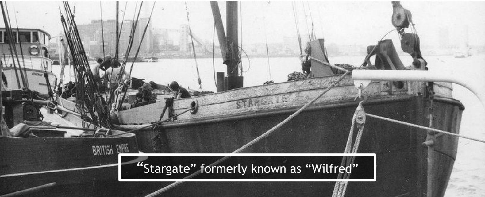
“Stargate” formerly known as “Wilfred”

When in port the vessels and their crew will be capable of delivering an out of classroom learning experience that works within the national curriculum. This will ensure that Coastal Communities and their educational establishments can carry out research and record an of each unique coastal communities', maritime past and present along with the social and economic importance with regard to their specific waterfront. This will include the history of their ports trade and the ship/boatbuilding with specific reference as to why certain craft developed, worked and thrived in certain areas and what has happened to them over the years. This research and recording to be incorporated into both digital and paper media to raise awareness of UK Heritage Harbours.