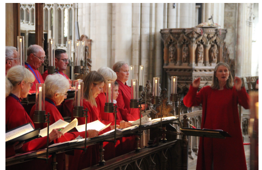
The choir rehearsing at Norwich Cathedral