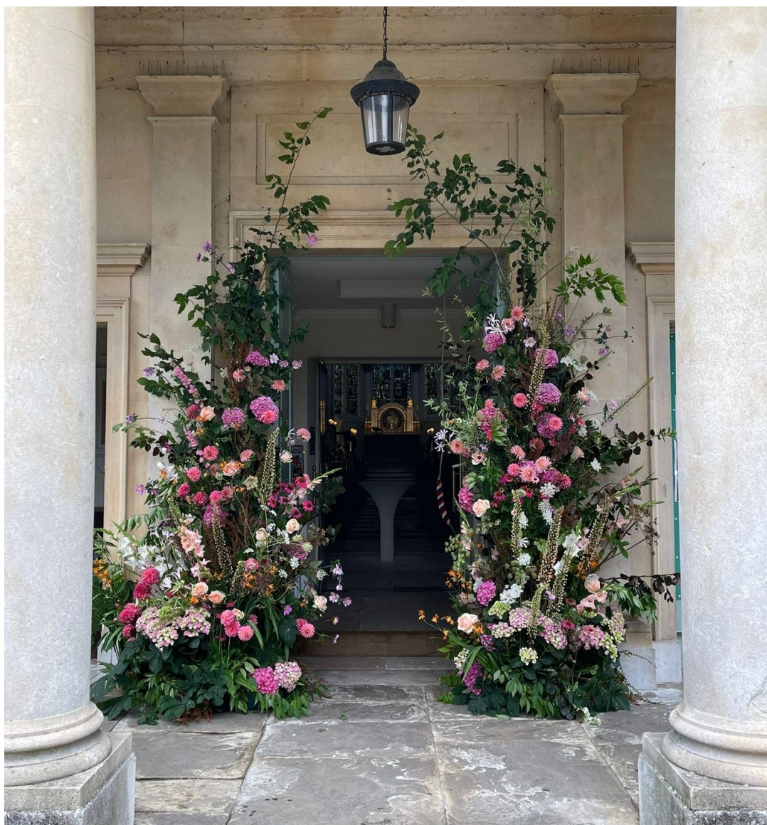
A view of St Anne's August 2024