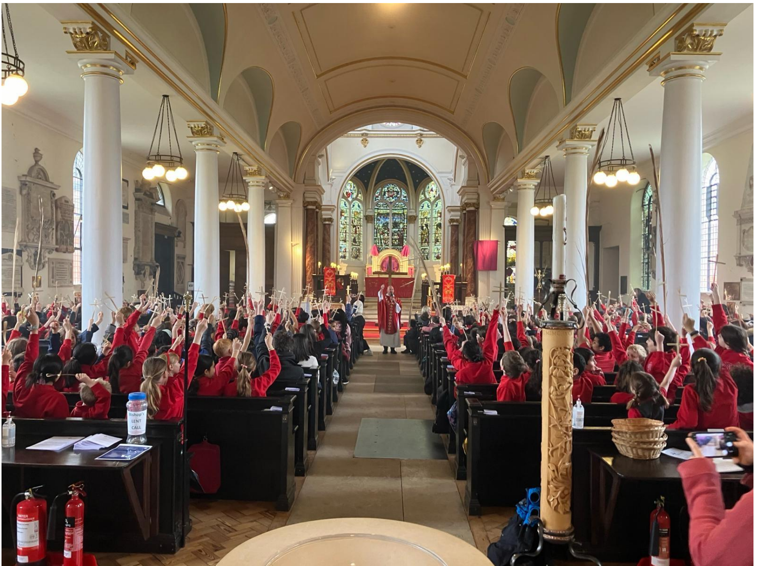
Blessing the Palms for The King's School at St Anne's