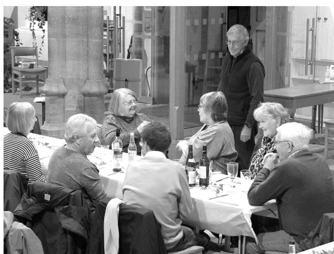
Harvest Supper at St Peter & St Paul's