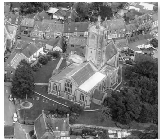
A bright and shiny new south aisle roof

Thanks to all of that, the impact of the roof replacement on our finances has not been as devastating as we had first feared it could be. Nevertheless, the headache of our finances remains a constant. 2021 was such an untypical year that comparison of the accounts this year with previous years gives little insight. The profile of our income remains noticeably reliant on a few very generous regular donors. Our expenditure is dominated by our Parish Share equivalent to a cost of around £500 per church member. In among all the