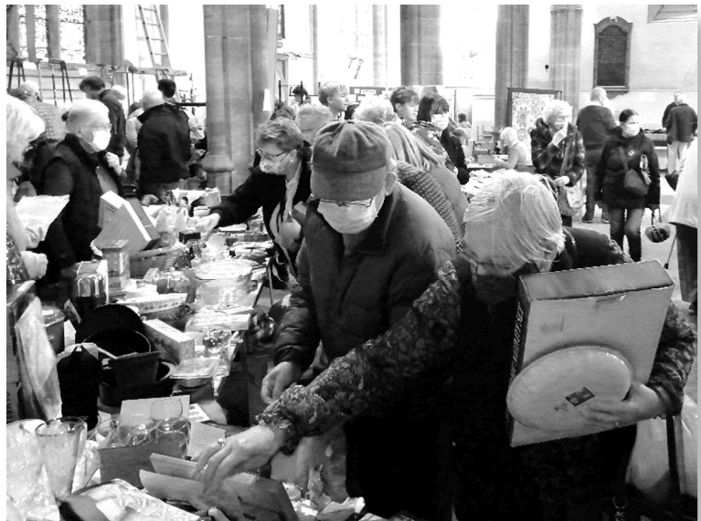
Autumn Fair: finding treasures in the bric-à-brac