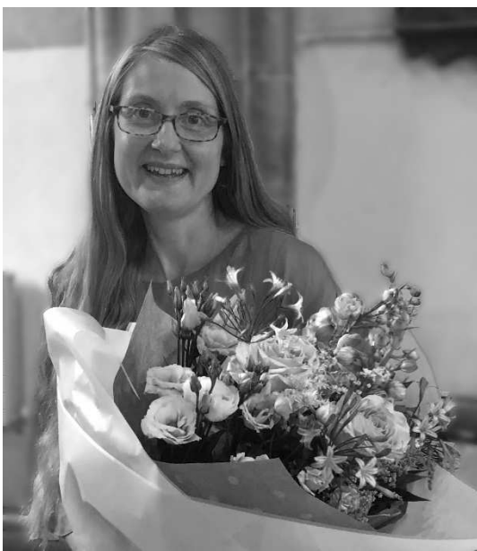
Words alone are not enough, but flowers may help