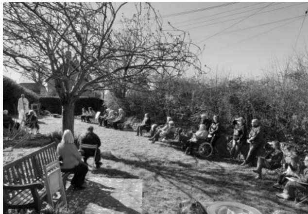
Easter Day service at St Michael's