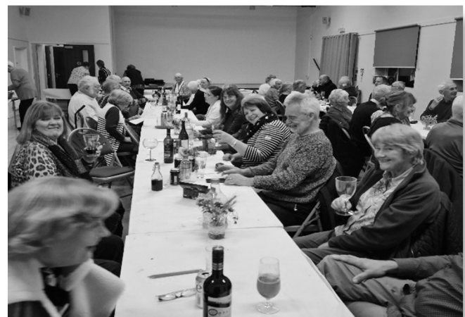
Harvest Supper at the Seavington Millennium Hall