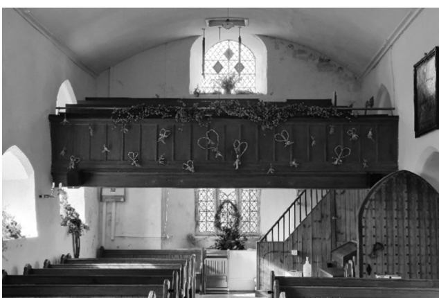
Flowers at a Seavington Wedding