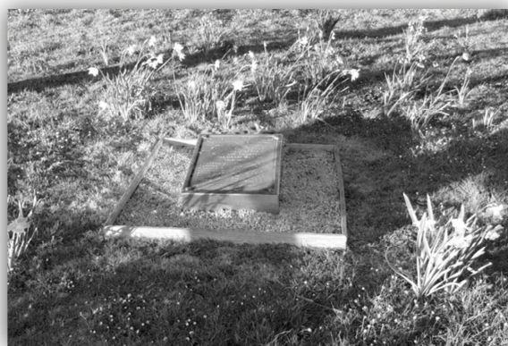
Refurbished WW1 Memorial in St Mary's churchyard