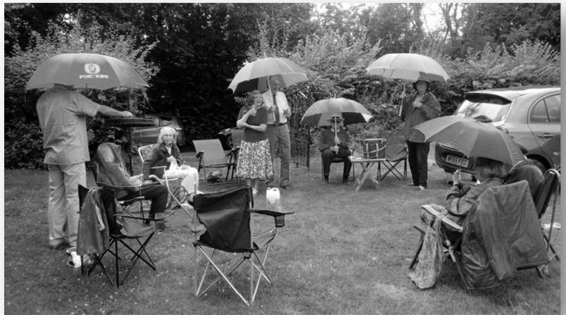
St James's Patronal Festival picnic lunch 2020