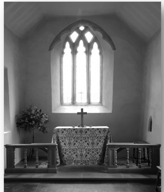
St James's Remembrance Sunday 2020

When the pandemic hit us all, it rapidly became clear that each church needed to manage the situation in its own way. But now we at St James's hope that the worst of the pandemic is over and that the three churches of the benefice will be able to join forces again.