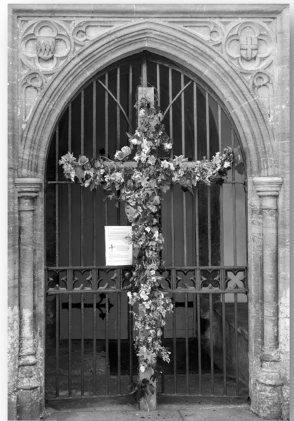
Easter Day: Cross of Flowers at St Peter & St Paul's

some going open-air; 'Sunday Worship at Home' distributed by e-mail or printed and dropped through letter boxes has become a thing; the Parish Magazine has continued; the plant sale went 'virtual' rather than not going ahead at all and was a very successful fundraiser, as indeed was Gift Day; South Petherton may not have had its Christmas Lights Switch-On event, but St Peter & St Paul's was still decorated with a 'forest of trees' laboured over at home by children and families, and residents of Burnworthy House to name but a few.