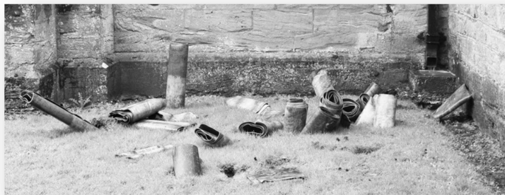
Lead where it should not be

It is often said that trouble comes in threes. In that regard, 2:30 am on 5 th March 2020 will long stick in the memory. For it is then that thieves went after the lead on the south aisle roof at St Peter & St Paul's. It is small comfort that they were interrupted in the course of their work and fled the scene empty handed. By then the lead had been stripped, rolled up and dropped down into the churchyard.