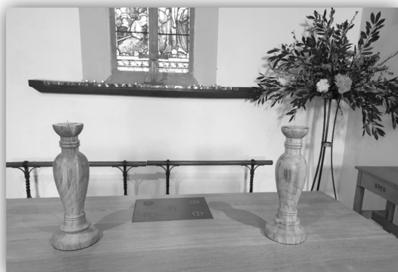
New candlesticks at St Michael's: turned from an ancient yew tree in the churchyard that had to be felled

The PCC's policy is to accumulate unrestricted funds from legacies and one-off donations in a "Memorial fund" for use primarily on capital projects. The PCC's policy is to hold reserves across all its unrestricted funds which are equivalent to four months' general expenditure. The PCC last reviewed this policy in July 2010. The policy of investing fund balances in the Central Board of Finance Church of England Deposit Fund has been standard for at least the past ten years.