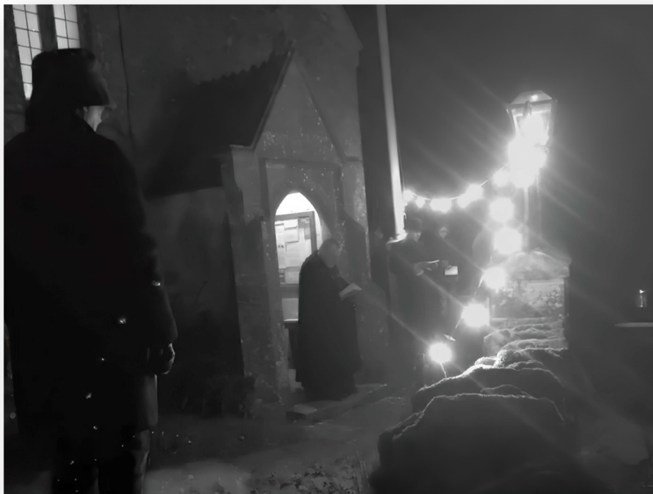
St James's Carol Service – Christmas Eve 2020

Similarly, there's been a new normal at St Michael's