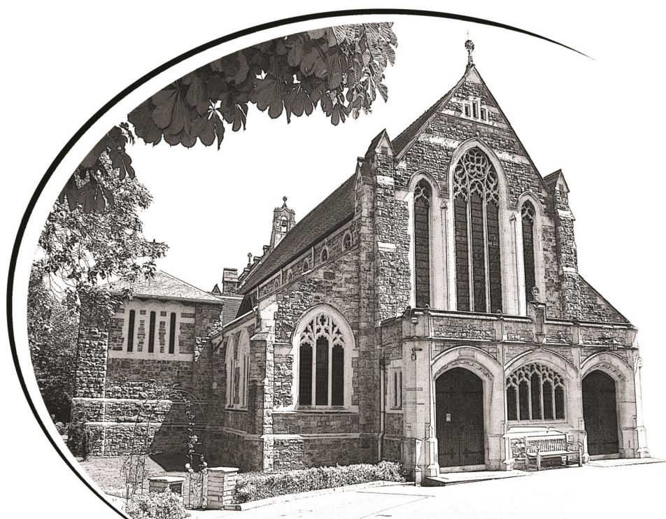
St. Mark's Church, Woodcote