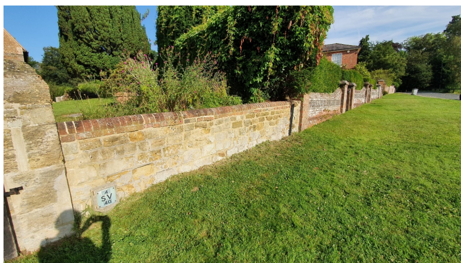
Boundary Wall after repairs

The Friends of St Mary's met the costs, for which we are very grateful.