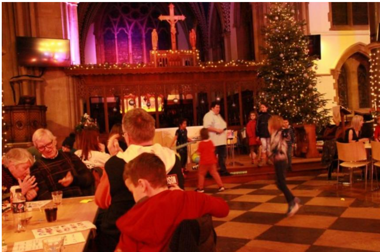
New Year's Eve Party