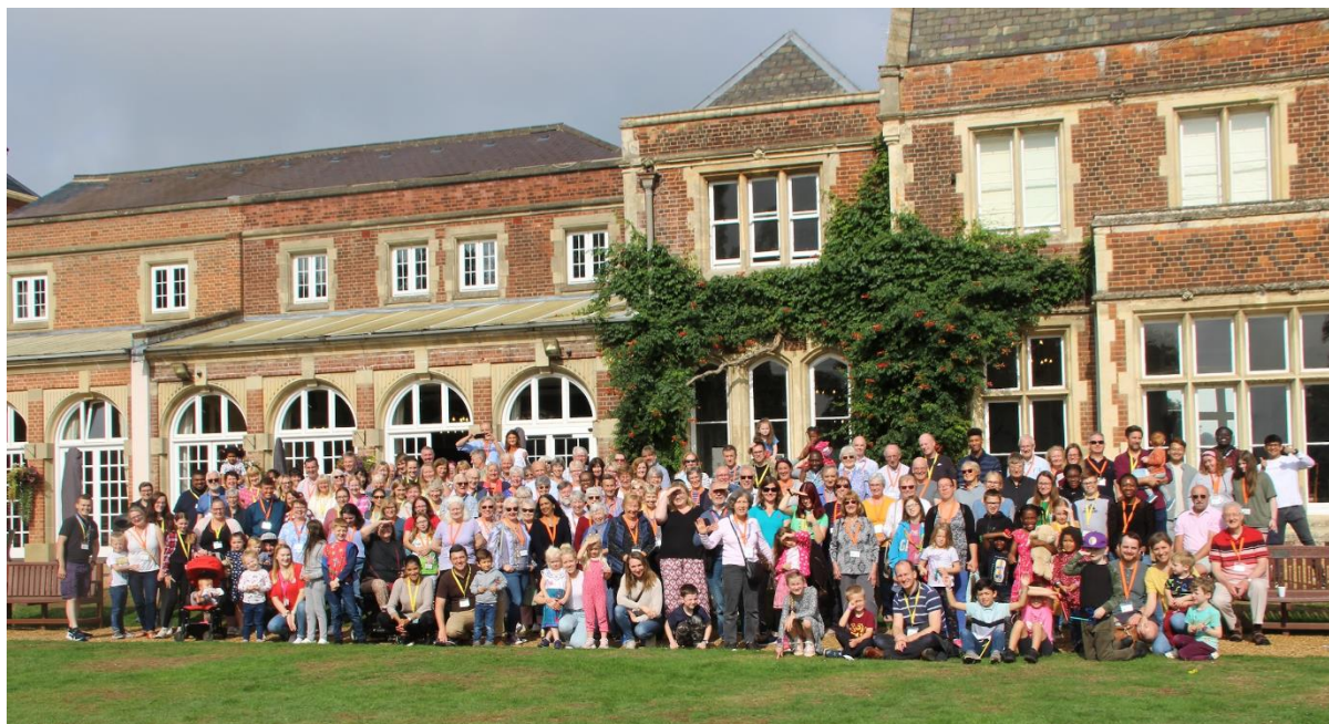
Our Parish Weekend Attendees

Remembrance Sunday was blessed with good weather and even more people attending.