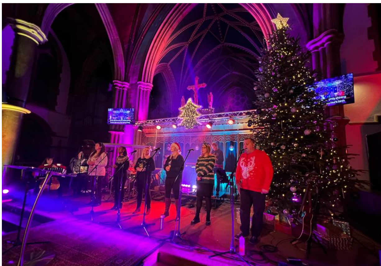
The Contemporary Carol Service

Our Christmas services ran as usual with good attendance at Contemporary Carols, Nine Lessons and Carols, the two Christingle services, Midnight Communion and the Christmas morning service.