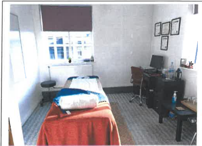
Treatment room in our Health and Wellbeing suite

We have set up a referral partnership with 10 GP practices in Community Partnership 5, where social prescribers refer adults with mental health issues for face-to-face support.