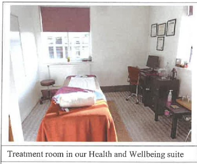
Treatment room in our Health and Wellbeing suite

We have set up a referral partnership with Thornbury Health Hub and a local Health Centre in Bradford 3 where co-ordinators and social prescribers refer adults with mental health issues for face-to-face support.