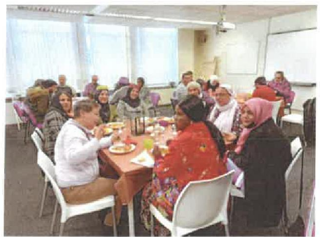
Christmas Lunch at Safety First

The coming year will see us again working with the most disadvantaged in our community particularly in view of the Government and Local Authority cuts. We expect to increase the amount of work with new communities, including support for refugees and asylum seekers.