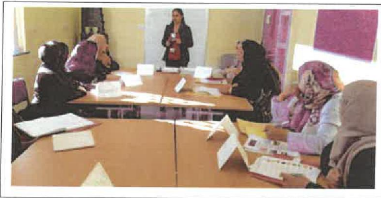
SFCTC Courses in the Community – ESOL and Employment

We continue to deliver employment-based training to adults who are furthest from the labour market. We have been able to deliver job match and I.T. training to over 1400 adults this year. We have helped 39 people into employment over the year.