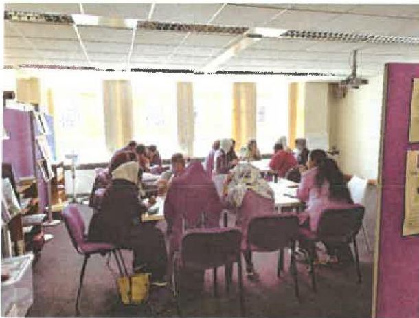
Busy ESOL class

Trustees Annual Report year end 31 st January 2023