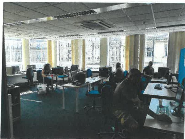
Socially distanced Employment Support session in ICT Suite

The Trustees at Safety First Community Training Centre would like to thank everyone who has supported the charity during this difficult year.