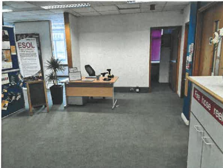
The Reception area of our new 4 th Floor provision

During the 2020/ 2021 year we also received funding from: