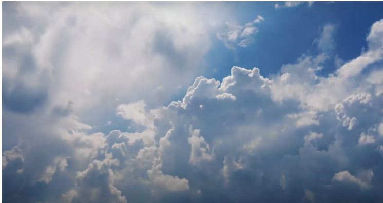
Arc of the Sky Videography Nathan Clarke

When lockdown happened in March 2020, the directors had to quickly adapt the project