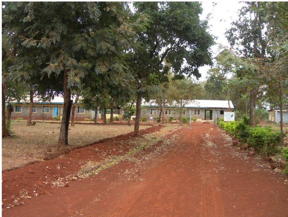
General view of Dining Hall & Dormitory that St Mary's have contributed to at Makutano