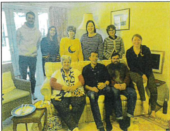
Staff team day, October 2023

House groups play an important part in the life of the church by encouraging friendship, enabling the growth of faith, providing pastoral care, and developing relationship with the local community. The church leadership has invested in training and encouraging the leaders of these groups who become increasingly important in the pastoral ministry of CBC. Leaders of pastoral ministries meet regularly, as a pastoral forum, to ensure we are serving and caring for everyone in the church. The mainstays of our pastoral care continue to be house groups and personal relationships. By the end of 2023 there were 22 such groups,