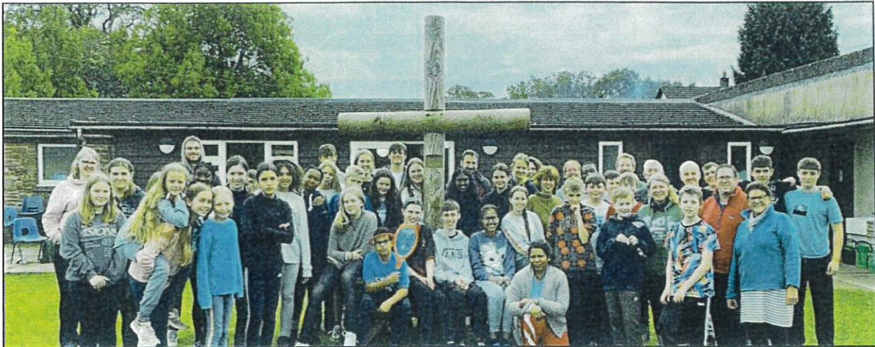
Viney Hill Youth Weekend Away, September 2023

There are a large number of other church activities which provide a means of friendship, encouragement, practical support and growth in Christian faith to all in the church. These cater for different ages, genders and interests, and contribute to the ethos and life of the church. They are a means of encouraging new people to come among us and benefit from what we provide. Numerous special events and regular activities took place during the year to provide opportunities for deepening friendships.