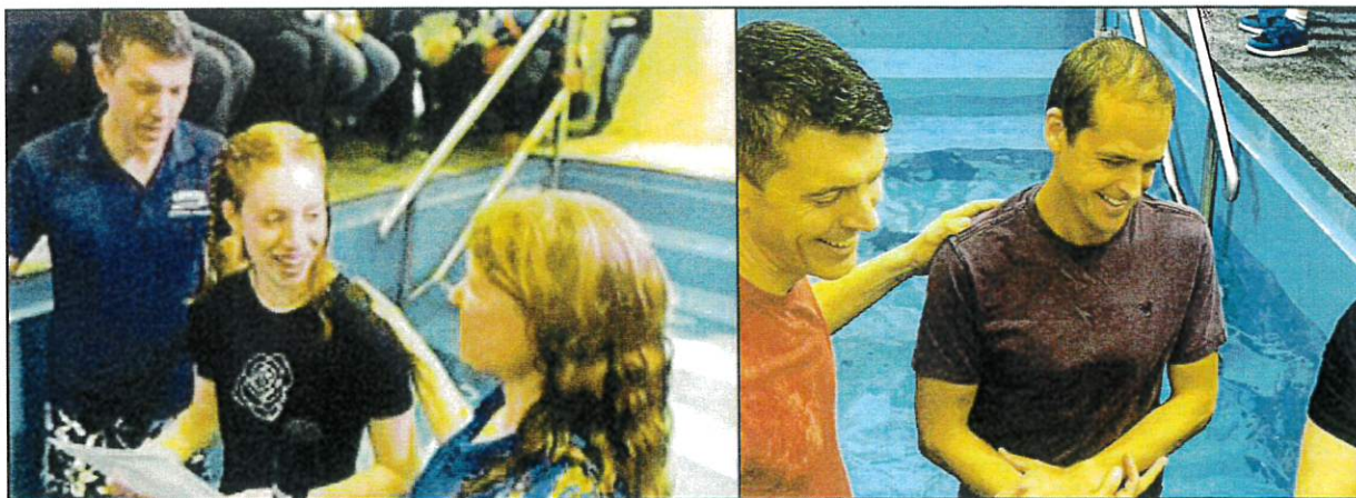
Baptisms from 2023

The Church does not only measure the success of its programs in numbers, including financial numbers, but also in less tangible areas like fellowship, support, and encouragement. The Trustees recognise that these are difficult to measure but believe that 2023 was a positive year in the life of the church.