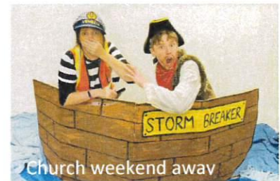
Church weekend away

There are a large number of other church activities which provide a means of friendship, encouragement, practical support and growth in Christian faith to all in the church. These cater for different ages, genders and interests, and contribute to the ethos and life of the church. They are a means of encouraging new people to come among us and benefit from what we provide. Numerous special events and regular activities took place during the year to provide opportunities for deepening friendships. In November 2021 we were able to hold a weekend away at the Pioneer Centre, Shropshire when 170 adults and children enjoyed teaching, fellowship and friendship together.