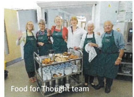
Food for Thought team

Our regular groups and meetings include monthly curry club, banner making group, craft group called Creative Hands and Hearts, Food for Thought (monthly lunch club for those around during the day), Friends Café (monthly support group for widow(er)s), monthly prayer breakfast, monthly prayer and worship evening, weekly prayer meeting, and the CBSingles group. The Time Out Café is open weekly on Wednesday mornings for coffee, cake and a chat. All of these groups have been able to restart in 2021 having stopped the previous year. They are slowly growing again.