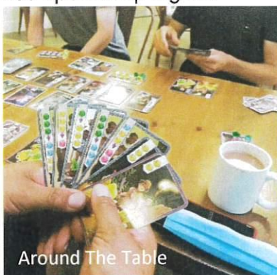
Around The Table

Twice monthly games evening called Around the Table continued online and then in person as the year progressed. This is also now growing again.